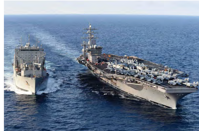
The Mid-Atlantic is home to world's largest naval station. Naval Station Norfolk supports 75 ships and 134 aircraft alongside 14 piers and 11 aircraft hangars, and houses the largest concentration of U.S. Navy forces. Military uses of the ocean are critically important for our region and the nation as a whole. It is vital they be coordinated with other ocean uses, including navigation, renewable energy, fishing, and recreation.

Finally, the RPB expresses interest in further exploring two options that would enable certain decisions related to the Coastal Zone Management Act (CZMA) to be more efficient, streamlined, and coordinated. The options relate to (1) providing earlier Federal notice to States and Tribes than current regulations require, where appropriate and practicable, and (2) improving States' abilities to execute the Federal Consistency provisions of the CZMA in the offshore space.