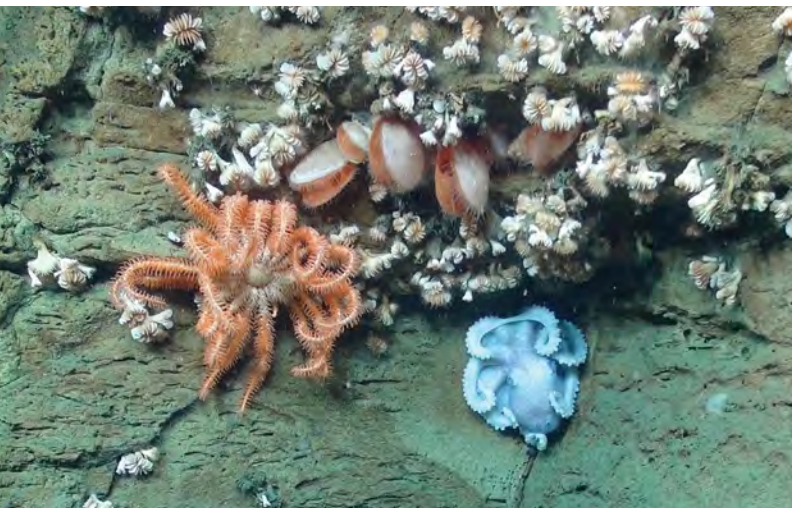
Often multiple species of invertebrates are found co-occurring on rock ledges and canyon walls near the edge of the Mid-Atlantic's continental shelf. Here a brisingid sea star, an octopus, bivalves, and several individuals of the cup coral, Desmophyllum , are found in close proximity to one another.

Best practices are a cornerstone of the Plan and directly support specific interjurisdictional coordination actions addressed in subsequent sections of this chapter. All RPB entities are strongly encouraged to use these best practices, which are voluntary for States and Tribes. Consistent with Executive Order 13547, Federal agencies will, to the extent practicable, implement best practices subject to each agency's implementation of its statutory and regulatory mandates.