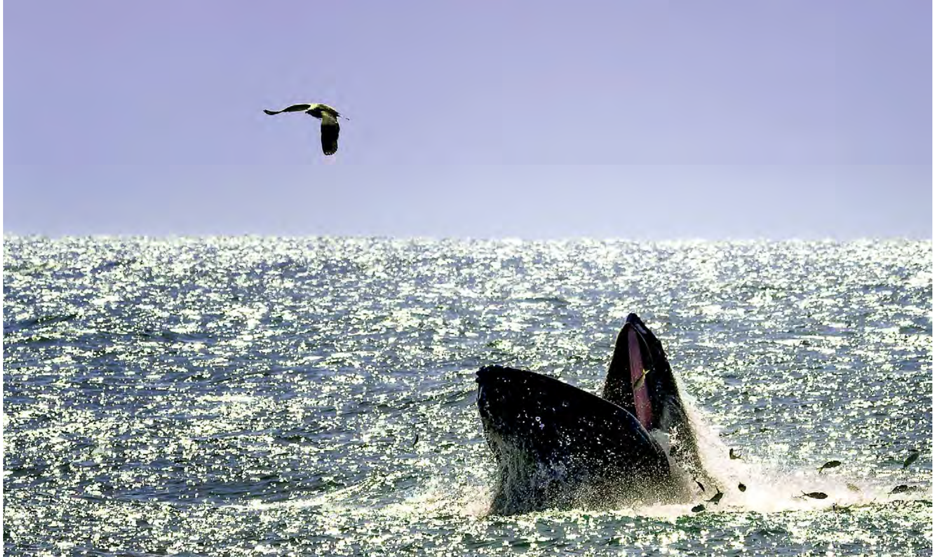
Humpback whale outside Long Beach, New York.