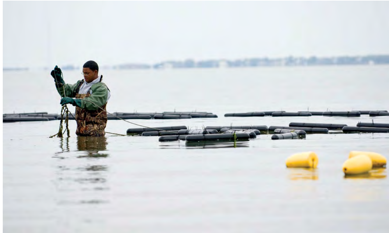
Tribes such as the Shinnecock Indian Nation of New York have an ancestral relationship with ocean resources.