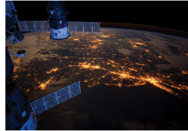
A view of the Mid-Atlantic region at night from the International Space Station looking from the Atlantic Ocean landward.

several key Plan components that are intended to work together and across levels of government, authorities, jurisdictions, and sectors to help achieve the region’s ocean planning goals and objectives. These include best practices and a series of actions to address the Healthy Ocean Ecosystem and Sustainable Ocean Uses goals. These actions are listed in Table 1 below.