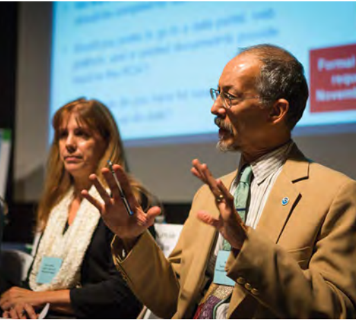
Members of the Mid-Atlantic Regional Planning Body discuss interagency coordination during a public listening session in Virginia Beach, Virginia.

There is no single management entity responsible for comprehensive, integrated stewardship of our domestic oceans. Responsibilities for ocean management are distributed among numerous Federal, State, and Tribal entities and include hundreds of laws, regulations, and policies. This distributed system poses challenges to managers striving for efficient, informed, and coordinated decision making. These challenges are increasing as society seeks to accommodate new and expanding ocean uses while simultaneously protecting the health of a rapidly changing natural system.