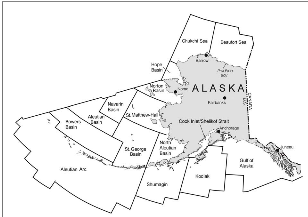
Figure 1. Map of the Alaska OCS Planning Areas.