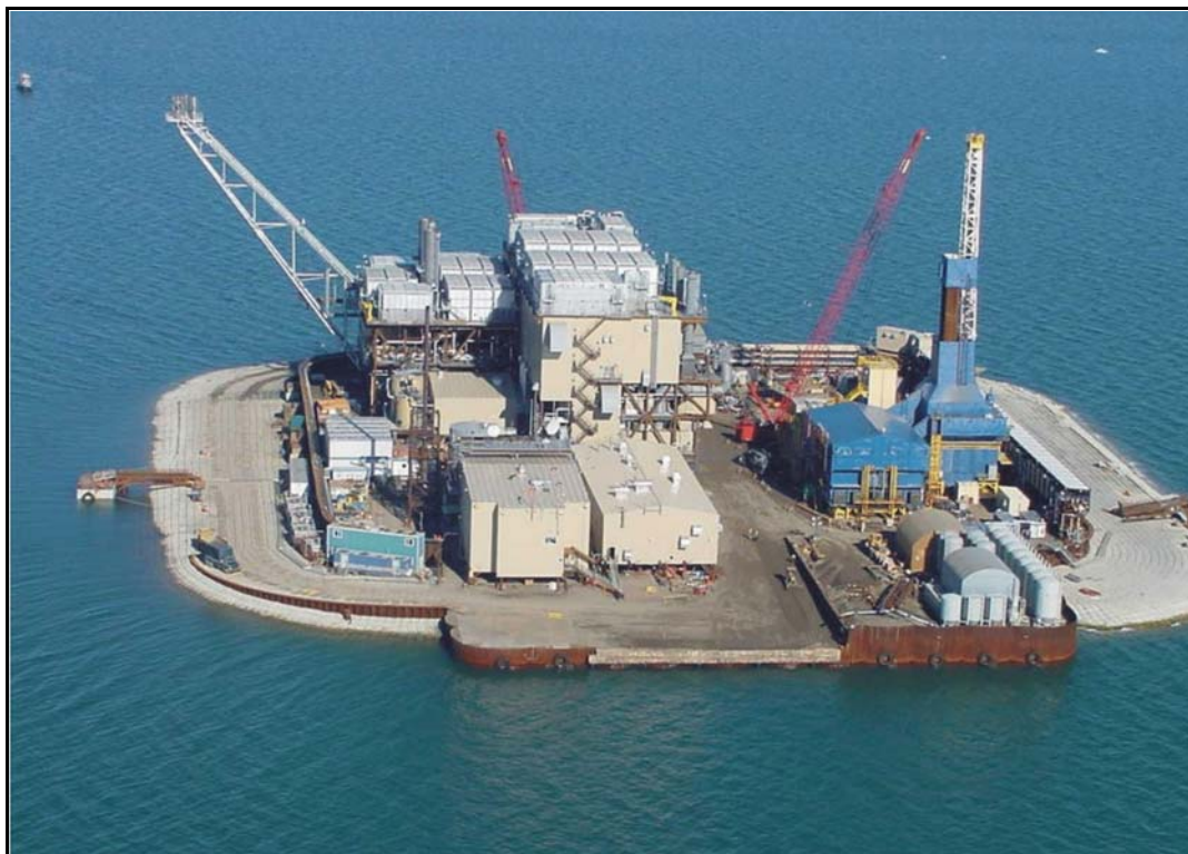
Figure 3. Northstar Island, looking north, September 2001. Production started November 2001.