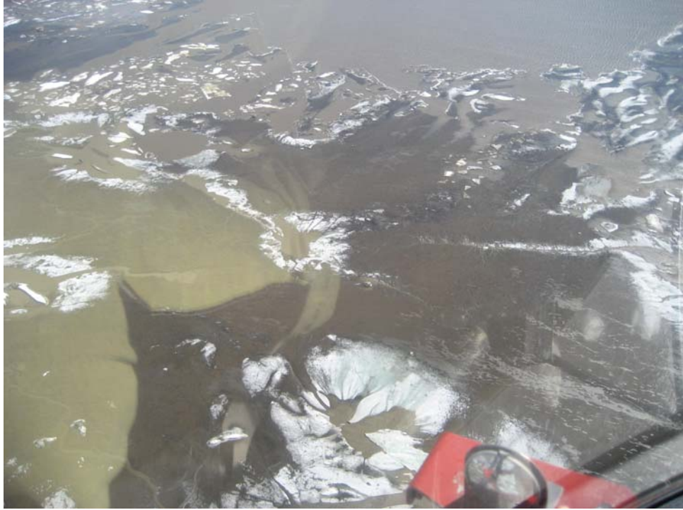
Photo Station 10, Strudel Drain