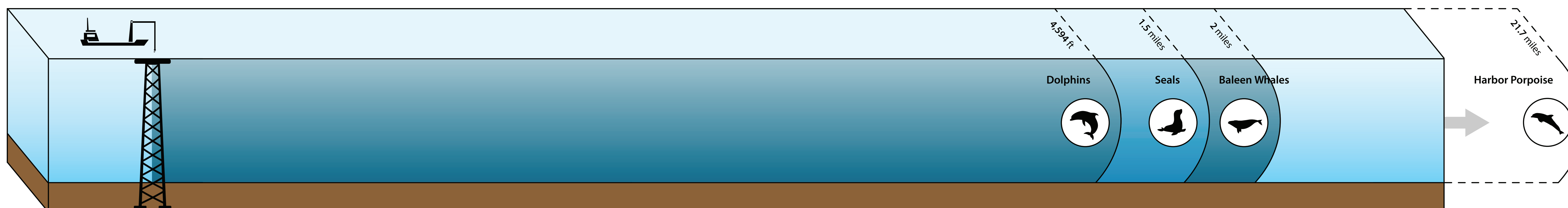
Distances to a 50% adverse behavioral disturbance for marine mammals at 160 dB RMS. Distances are adjusted for hearing sensitivity for animal groups shown.