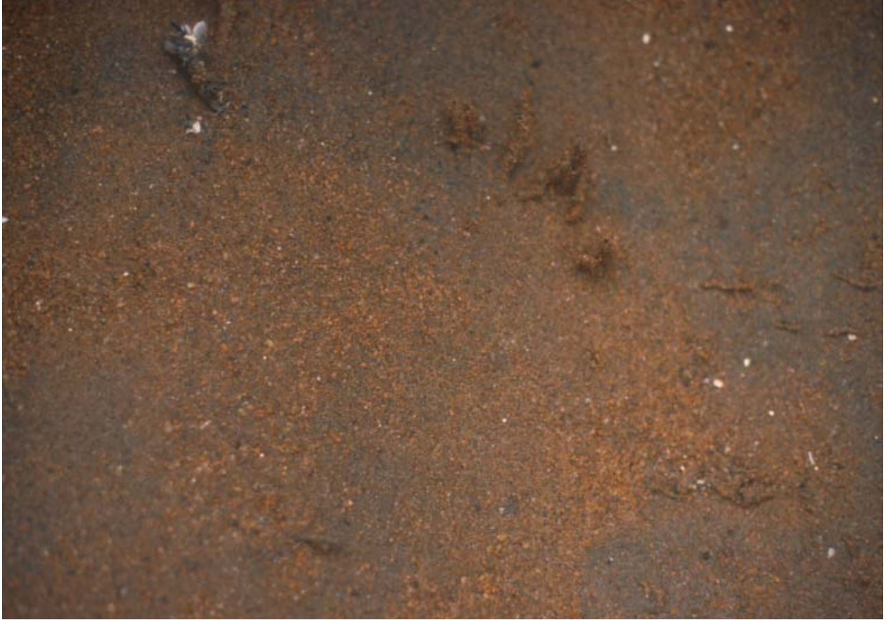
Partially oxidized sand retrieved in box-core sampler during USGS sampling campaign on San Pedro Shelf.