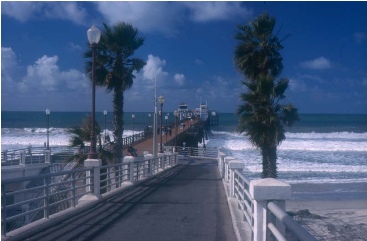
Oceanside Pier, San Diego County