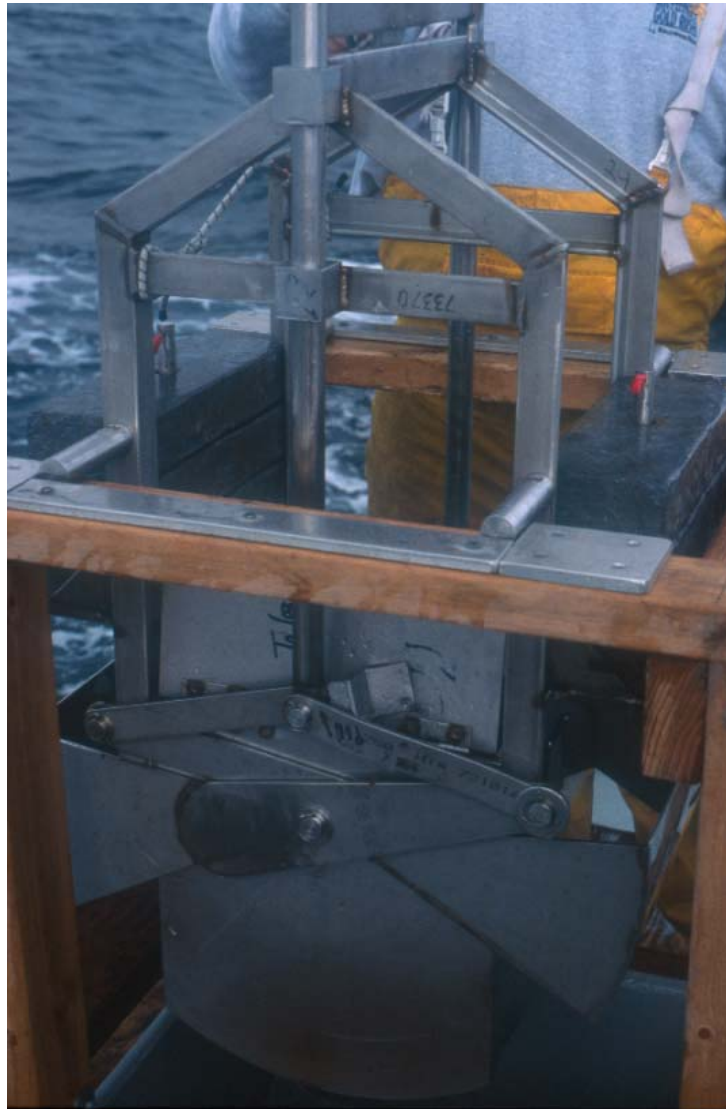
Customized box-core sampler used for the USGS sampling campaign on San Pedro Shelf in December 2004.

CGS began working collaboratively with the USGS on this project as a means of aiding the CGS definition of sand deposits on the shelf. In December 2004, a major seafloor-sampling campaign was conducted on San Pedro Shelf by the USGS aboard the R/V Early Bird to aid the multibeam facies mapping. Approximately 200 bottom samples were collected; the USGS generously allowed CGS to research and define locations for twenty of the sampling sites. The following four photographs are from that sampling campaign.