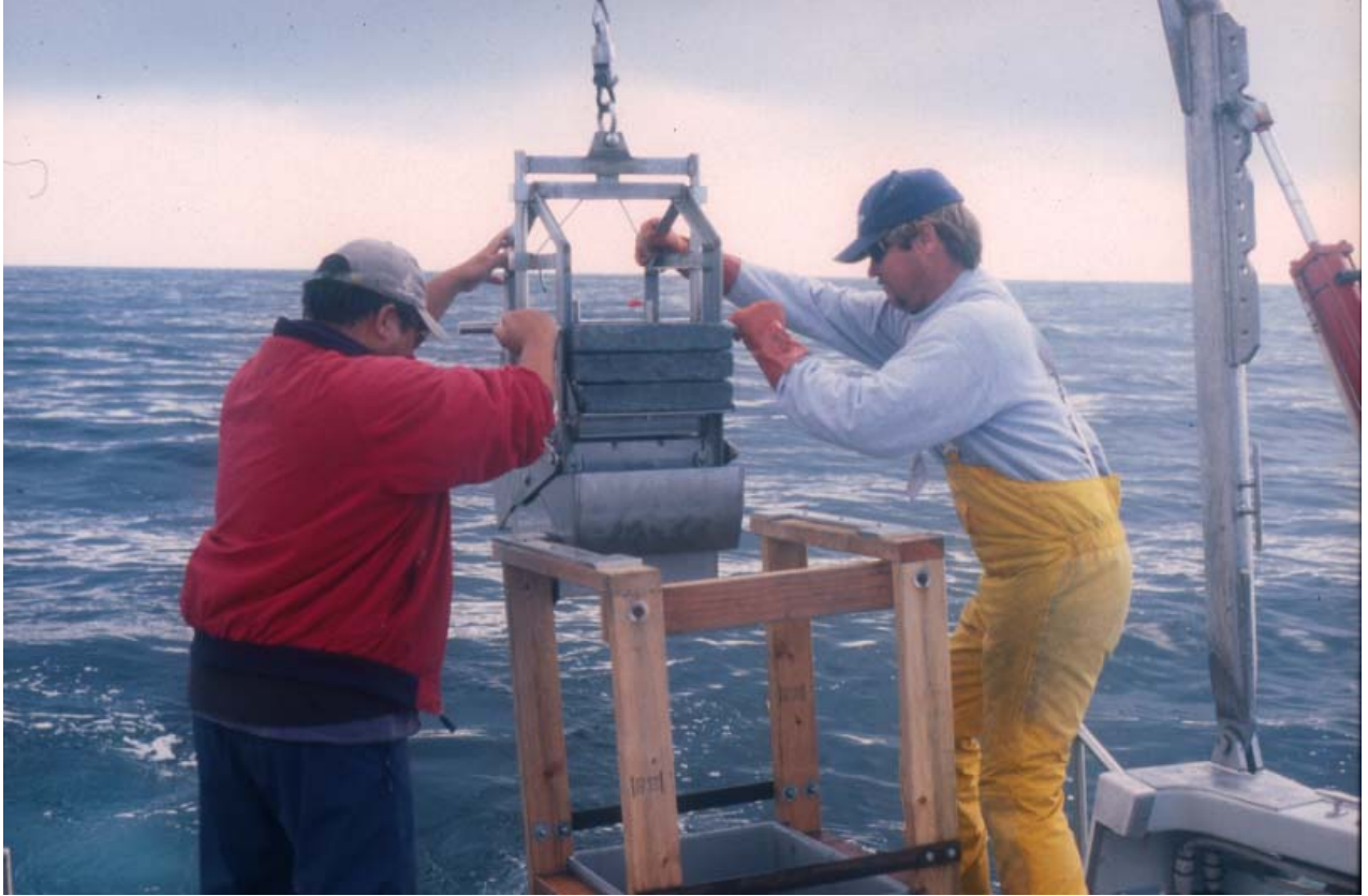
Deployment of the box-core sampler by staff of the Orange County Sanitation District aboard R/V Early Bird during the sampling campaign on San Pedro Shelf.