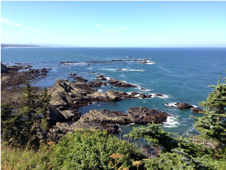
Cape Arago, Oregon