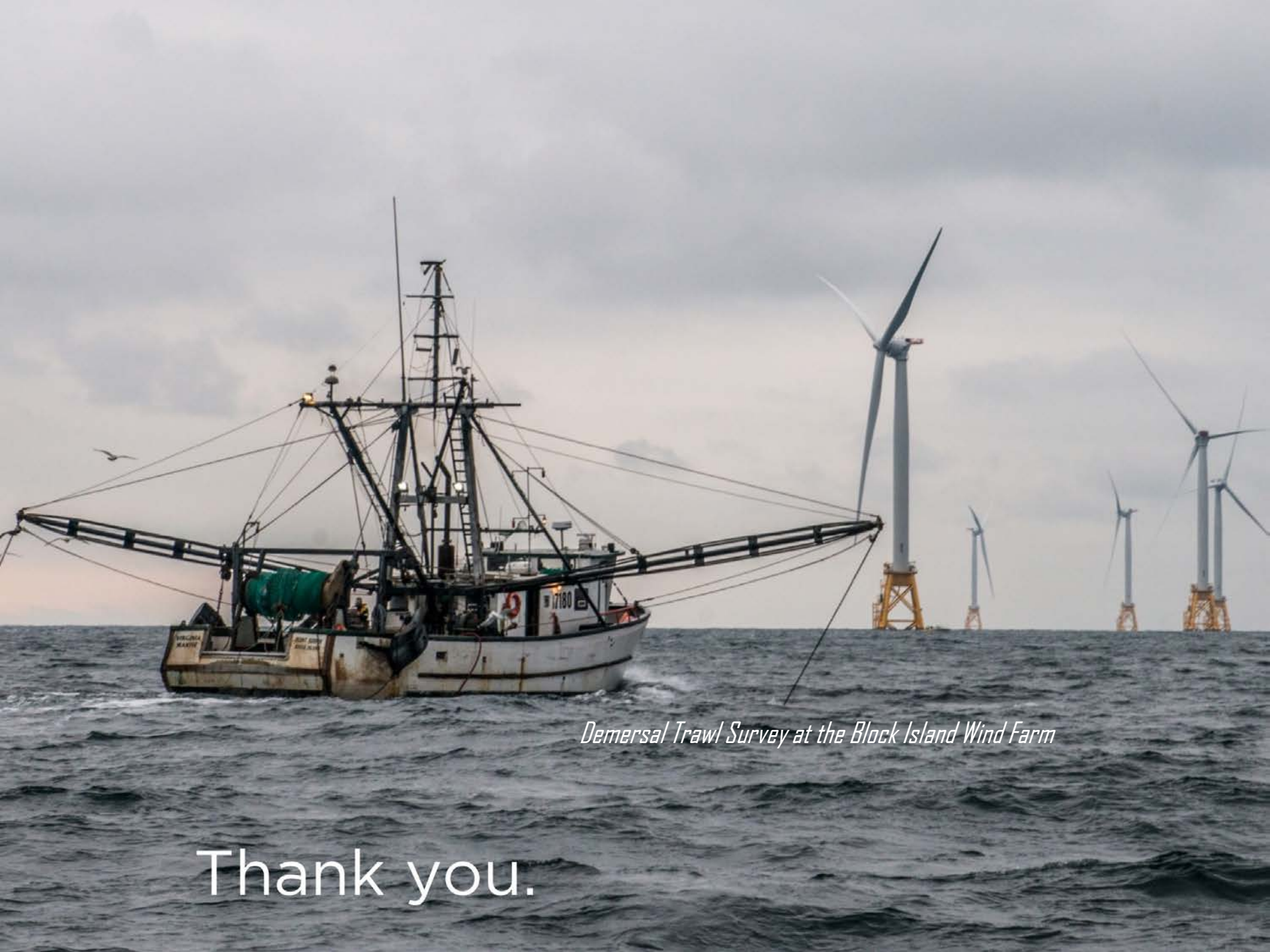
Demersal Trawl Survey at the Block Island Wind Farm