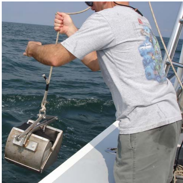
Figure 3. Deployment of VanVeen Grab from the deck of the observation platform