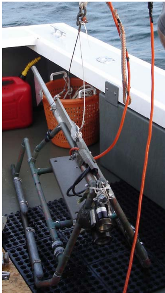
Figure 2. Simrad OE9030/9031 Diver Television System