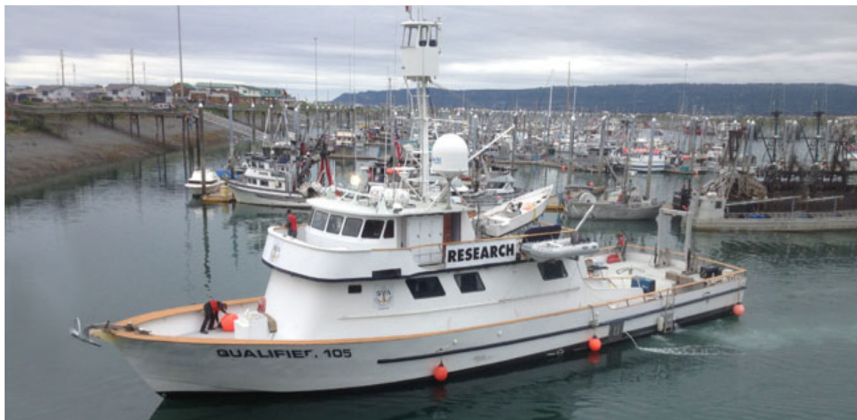
Figure 2 R/V Q105

A custom mounting arm built specifically for surveying with multibeam sonars is currently installed aboard the R/V Q105 featuring a hydraulic actuator which allows the sonar to be safely deployed and recovered with minimal effort. Specifications of the R/V Q105 are depicted in Figure 3.