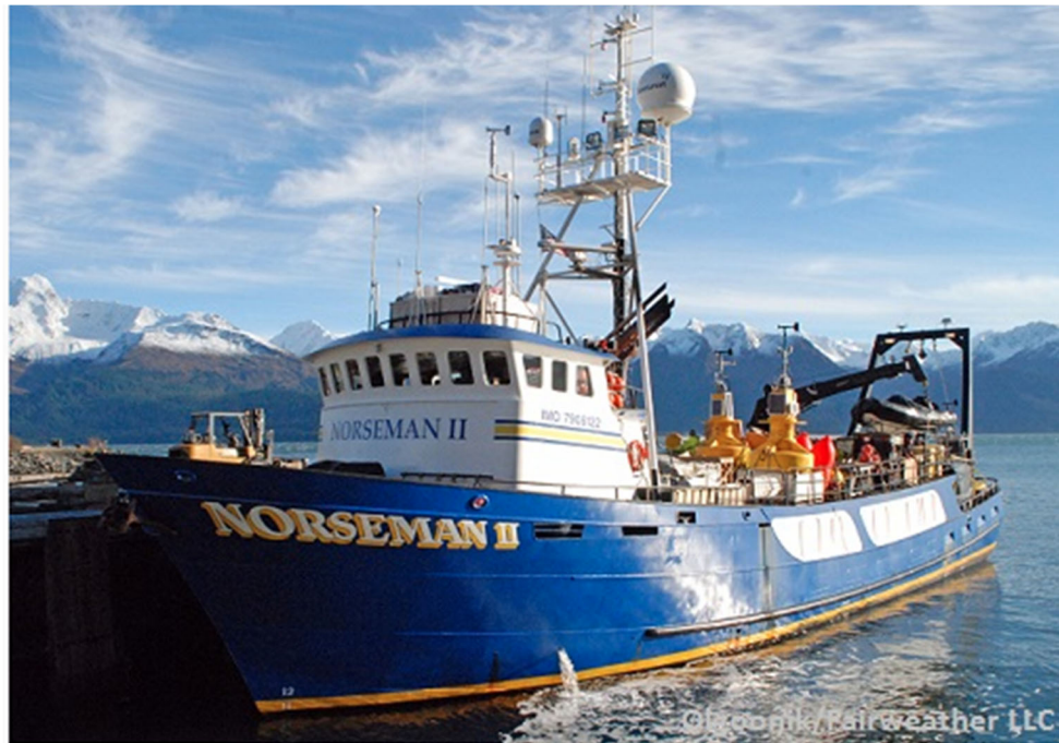
Figure 4 R/V Norseman II