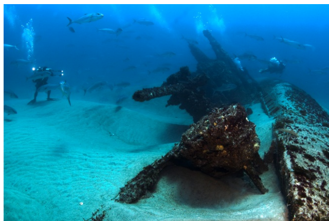
Wreck of U-701, Battle of the Atlantic Expedition (NOAA/ONMS).

Examples of historic properties, including archaeological resources, on the Outer Continental Shelf are shipwrecks, sunken aircraft, lighthouses, and prehistoric archaeological sites. Archaeological resources as defined by 30 CFR § 550.105 are material remains of human life or activities that are at least 50 years of age and of archaeological interest. The National Historic Preservation Act requires consideration of historic properties during Federal undertakings. The Sunken Military Craft Act and the Antiquities Act may also apply in certain circumstances.