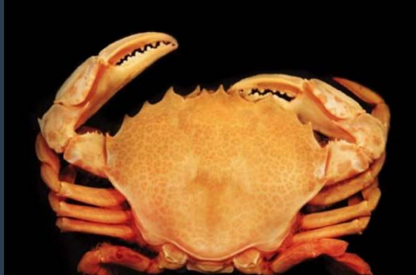
Lady crab, Ovalipes ocellatus , on display at the NMNH Sant Ocean Hall

Study Products (available in ESPIS): Final report, technical summary, related publications, data