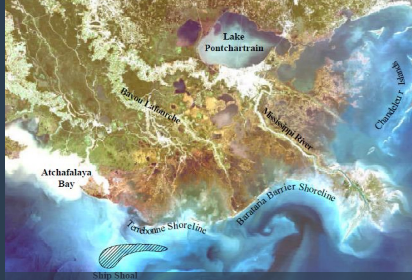
Location of Ship Shoal, offshore Terrebonne shoreline

Study Products (available in ESPIS): Final report