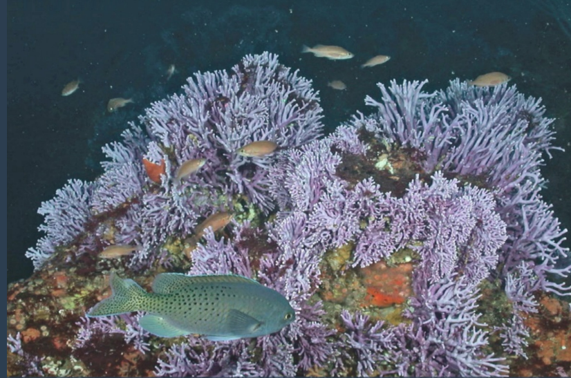
Stylaster californicus with a Blacksmith ( Chromis punctipinnis ) and many Squarespot ( Sebastes hopkinsi ) at 41 m depth on Farnsworth Bank

Study Products (available in ESPIS): Final reports, technical summary