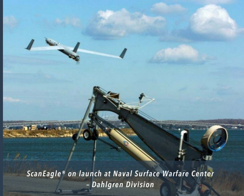
ScanEagle® on launch at Naval Surface Warfare Center - Dahlgren Division

Study Products (available in ESPIS): Final report, technical summary