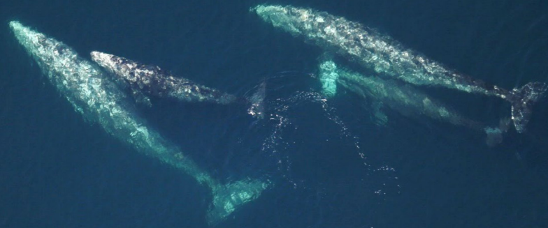
Pair of gray whale cow-calf pairs sighted approximately 20 km west of Wainwright, Alaska, 17 July 2019

Study Products (available in ESPIS): Final report, technical summary