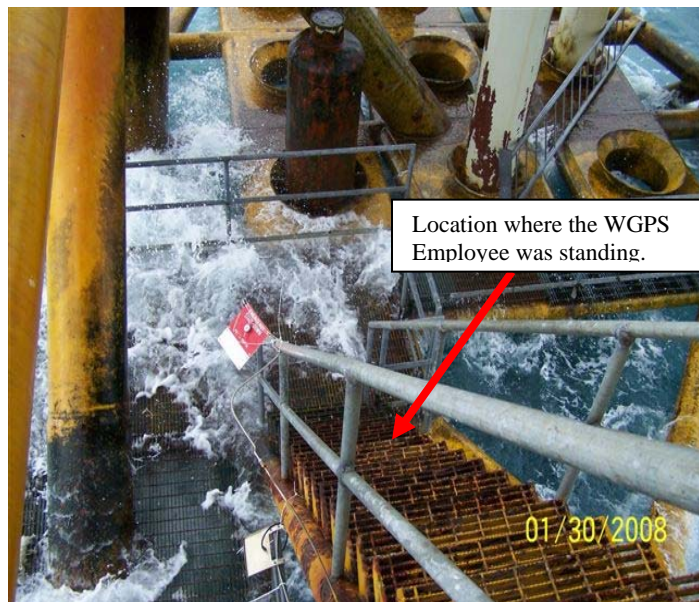
Figure 3: Photo of the WGPS Employee's location on stairs leading to boat landing.

The OSW was tasked to perform regularly scheduled navigation aid inspections or "Quarterly Inspections". The WGPS Employee volunteered to go to PN 969 on the morning of January 19, 2008 with the task of assessing the reason for shut in and to bring the platform back online. It was assumed that the ESD was the likely cause of the shut in. If the ESD was determined to be the cause of shut in, the plan was to affect permanent repair if feasible (temporary if needed) in order to bring the platform back online. The WGPS Employee (presumably) determined that the permanent fix was feasible and descended the stairways to an elevation of approximately +10 to +12 feet above the boat landing.