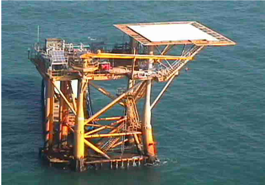
Figure 1: Photo of PN 969, Platform JA.

designated Operator on October 3, 2007. The platform is an unmanned facility that is operated on behalf of Peregrine by WGPS' personnel quartered at Platform A, PN 975.