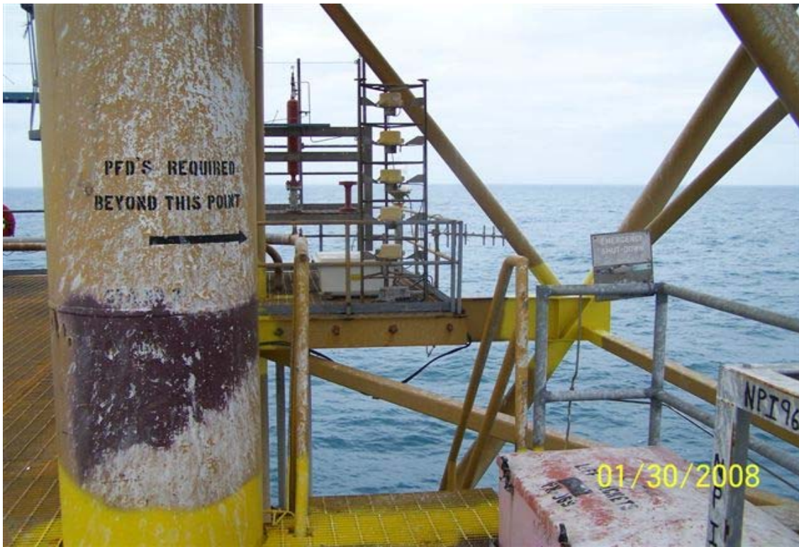
Figure 5: Photo of sign stating “PFD’S REQUIRED BEYOND THIS POINT”.