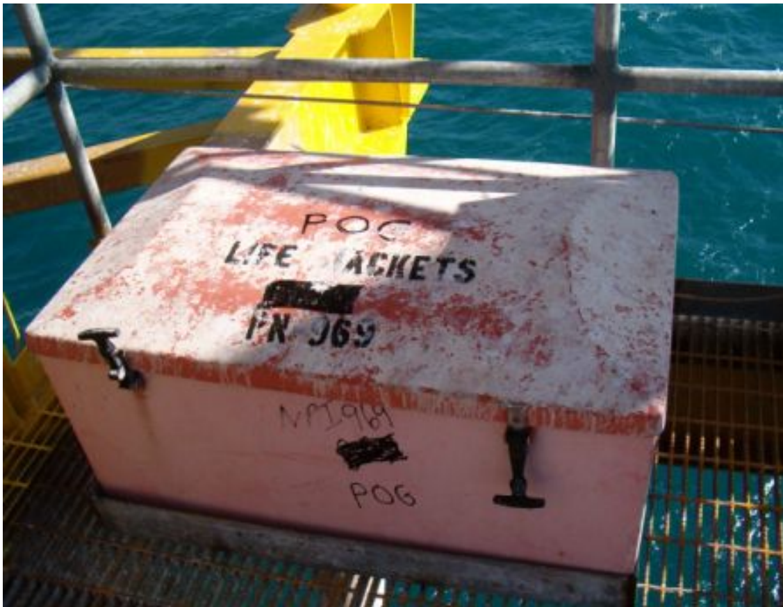
Figure 4: Photo of life jacket box at the top of the stairs.

There was a WGPS policy granting all individuals “stop work authority” for reasons of safety at the time of the incident. Interviews indicate that the WGPS Employee, the OSW, and the Lead Operator were aware of the policy. No employee exercised this authority to stop work.