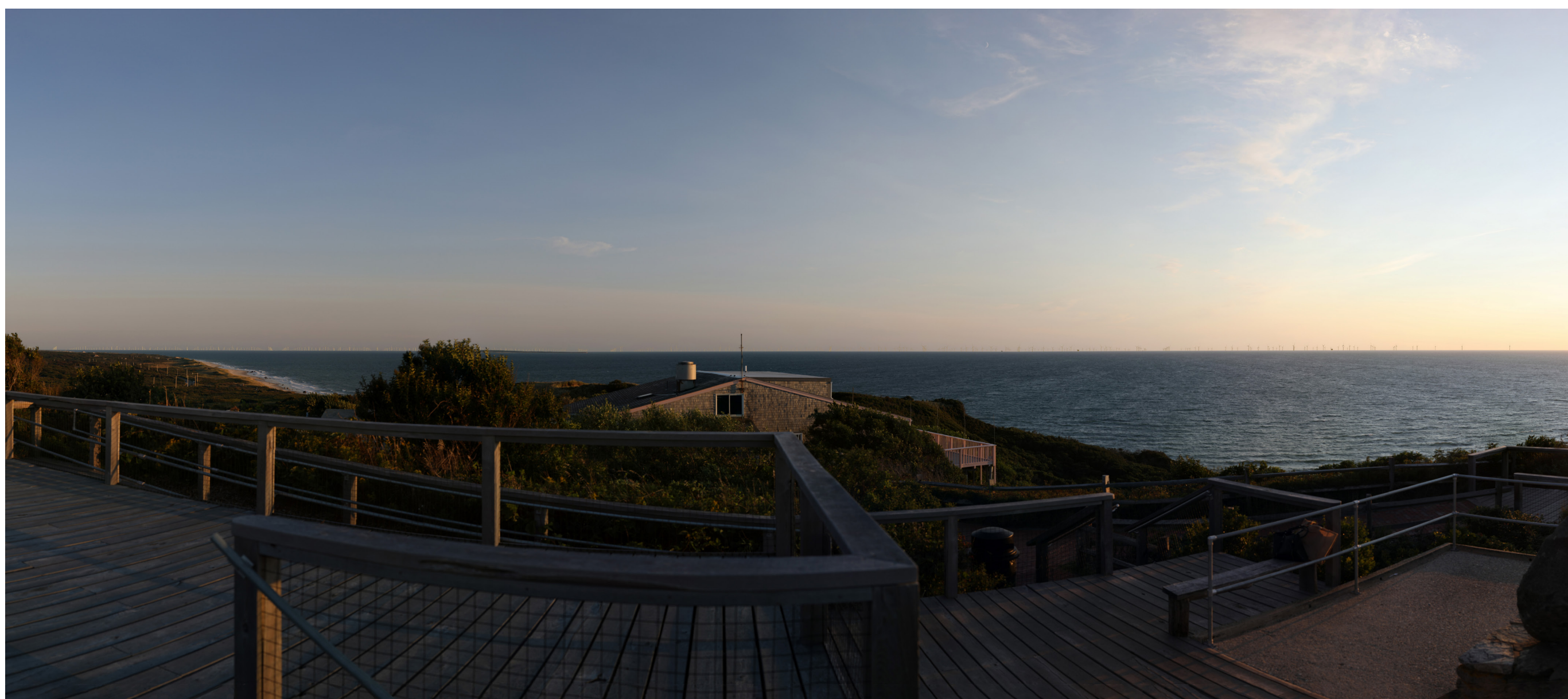
Sunset view of full lease build-out at Aquinnah Overlook, Aquinnah, Massachusetts.

Simulations formatted for poster presentation, not set to a precise viewing scale.