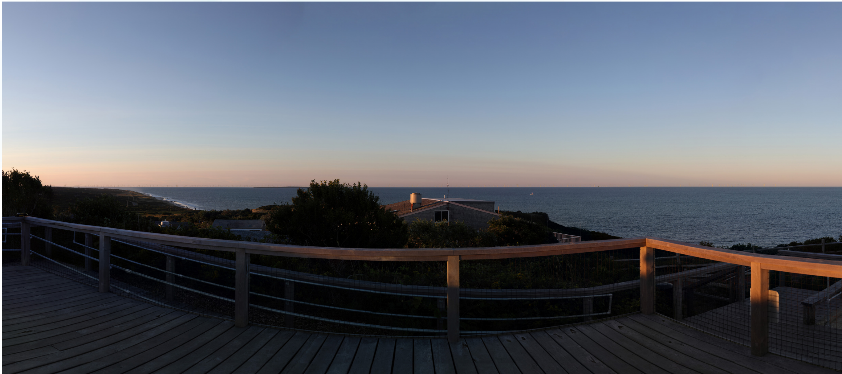
Sunrise view of full lease build-out at Aquinnah Overlook, Aquinnah, Massachusetts.

Key Observation Point MV07 – View to the south – Distance to Project 13.7 miles