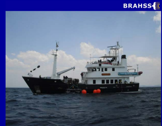
2011 Field Season