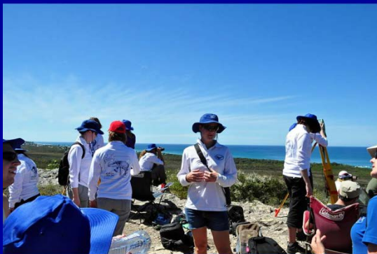
2011 Field Season

Since 1998, 15 M$ Noise Impacts Studies Alternative Technology Workshop Sperm Whale Seismic Study (BRS) Australian Humpback Whale BRS