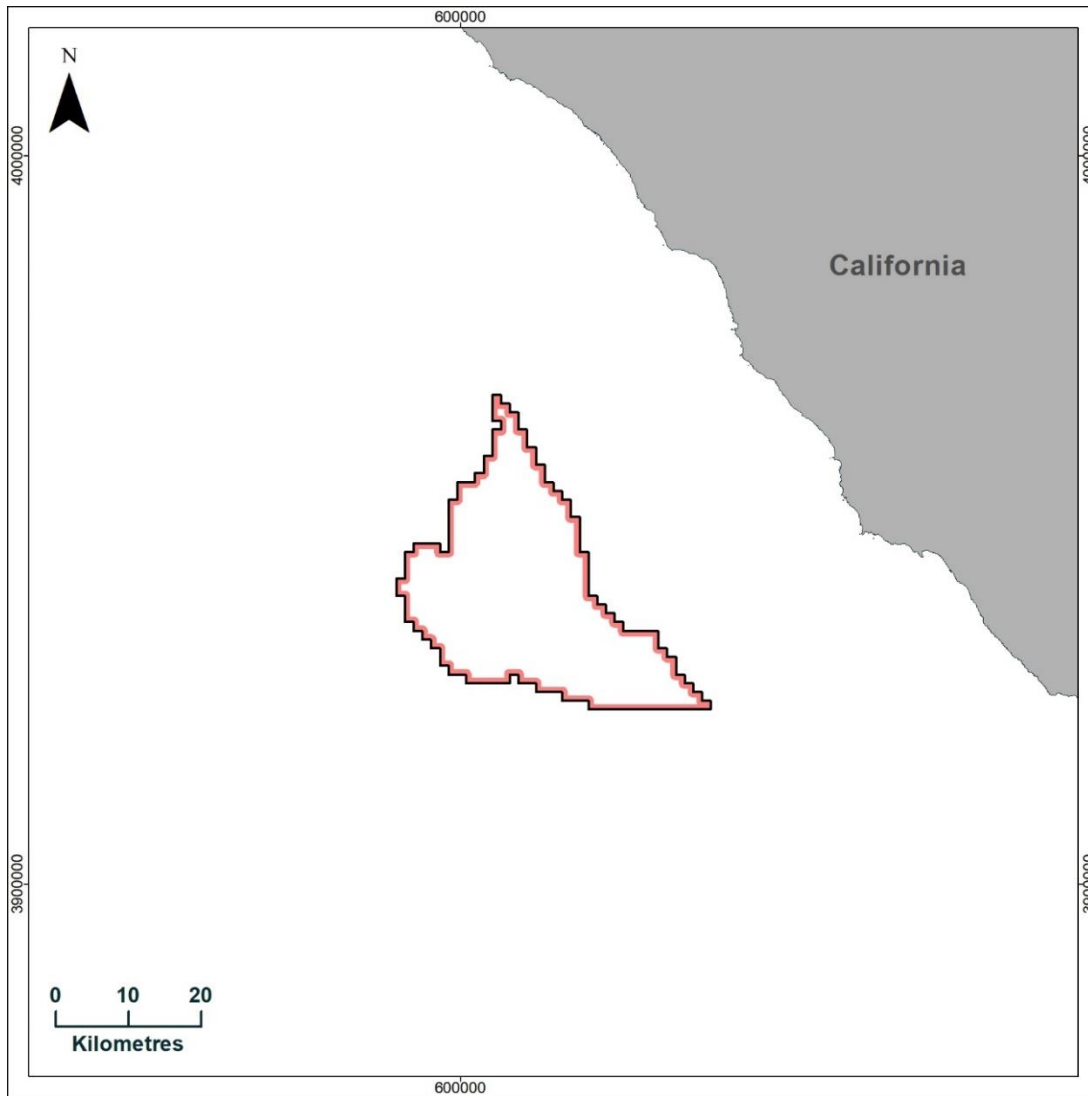
Figure: Avangrid Renewables' nominated area Morro Bay.