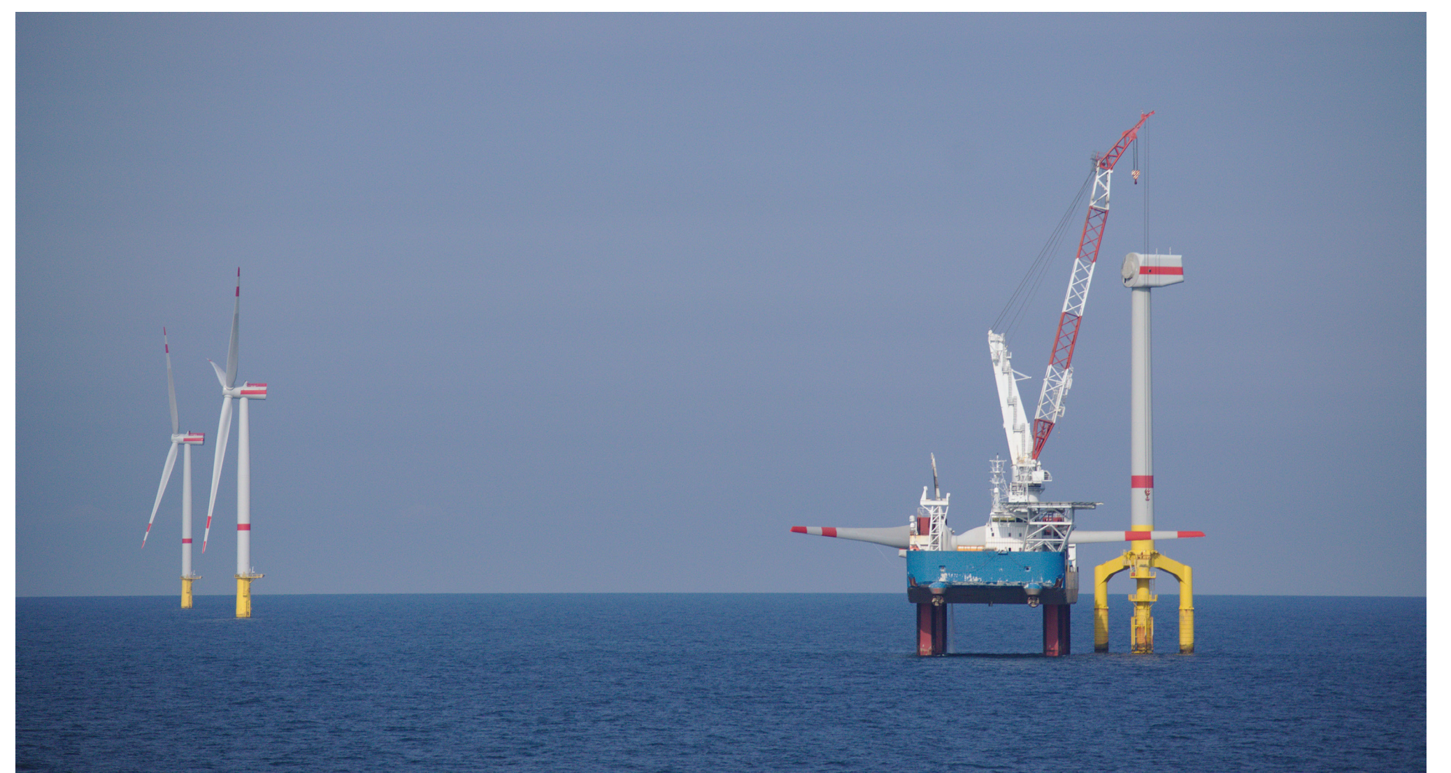
Offshore Wind Turbine Installation