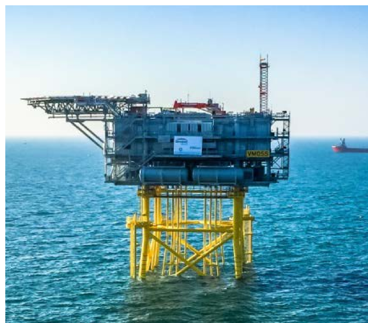
Indicative image of an Offshore Substation