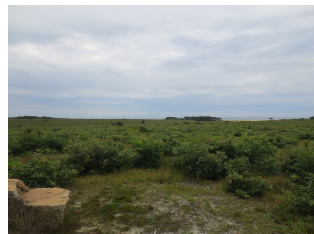
View toward the SWDA at the end of Wasque Avenue. Wasque Reservation, Chappaquiddick