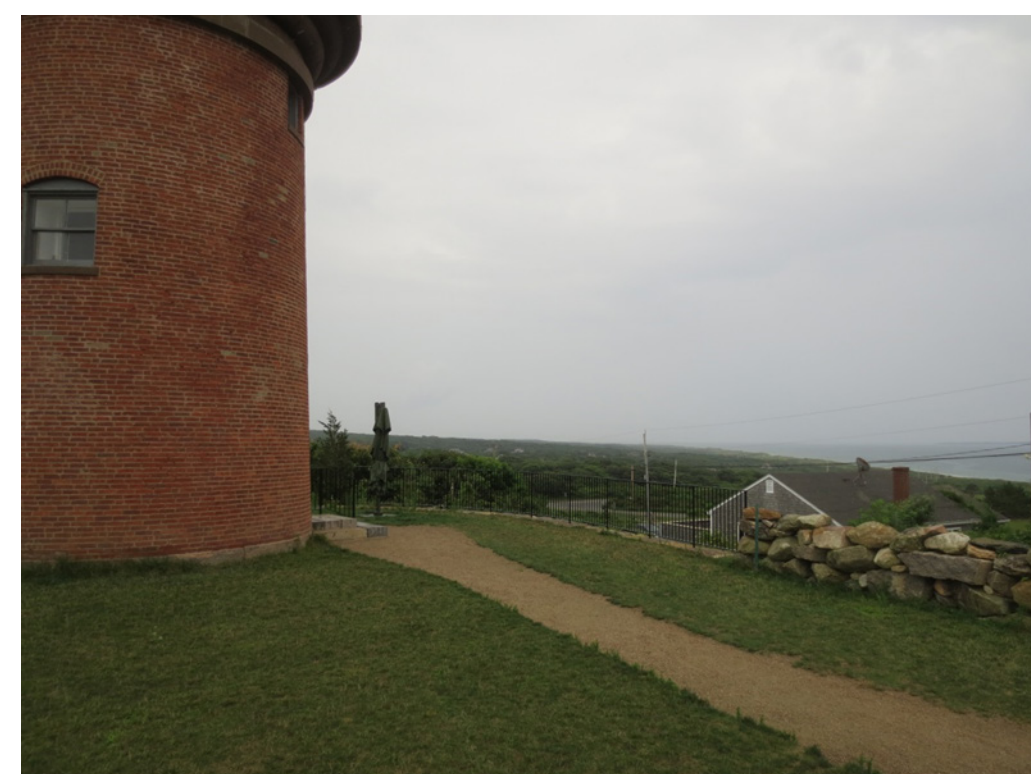
View southeast toward the SWDA, at right. Gay Head Lighthouse, Aquinnah