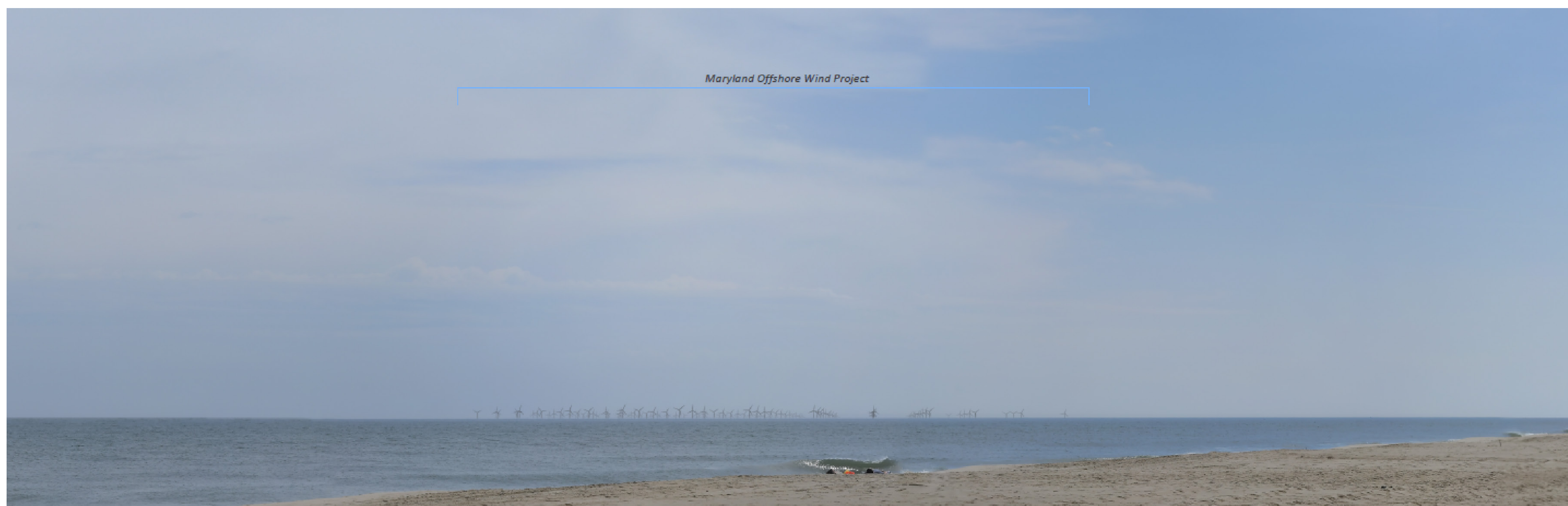
Cropped Single Frame (50-mm lens) Simulation, Right Half of the Panoramic View and Project Extents