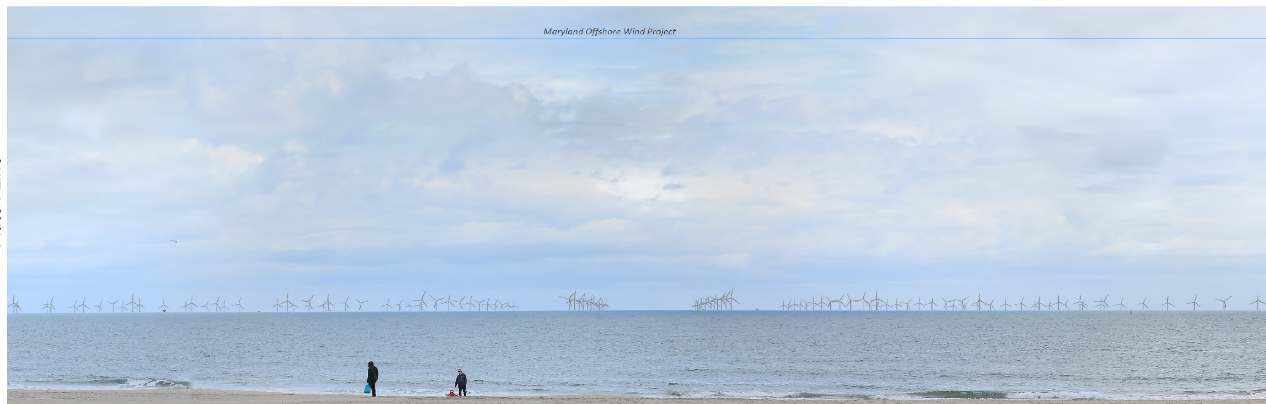
Cropped Single Frame (50-mm LENS) Simulation, Right Half of the Panoramic View and Project Extents