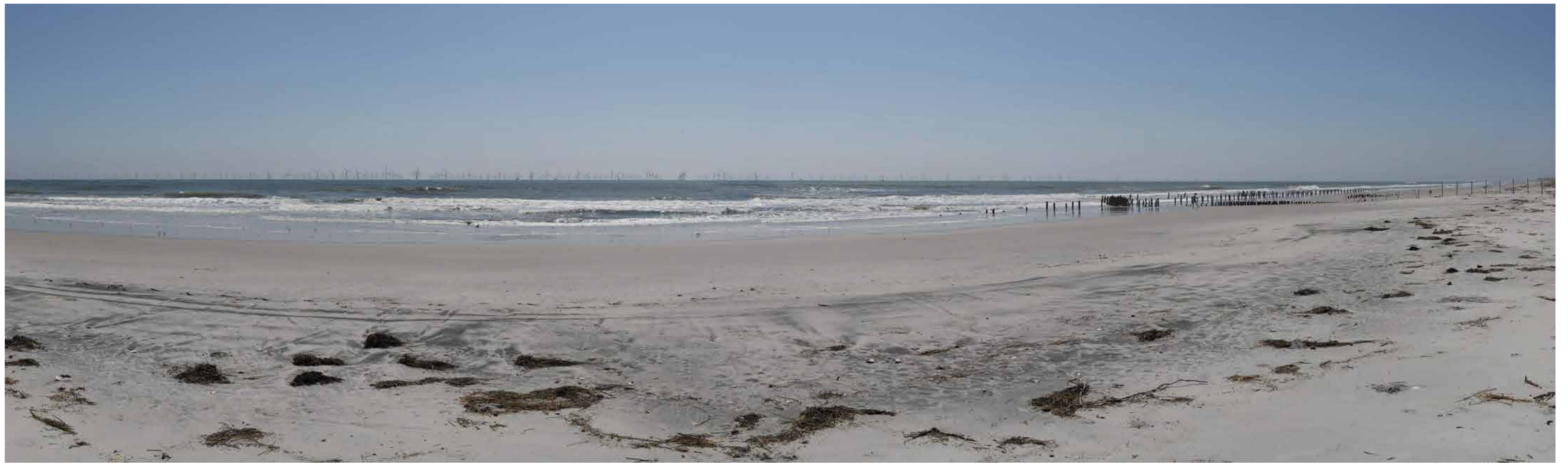
Daytime south-southeast view of full lease build-out at North Brigantine Natural Area, Brigantine City, New Jersey