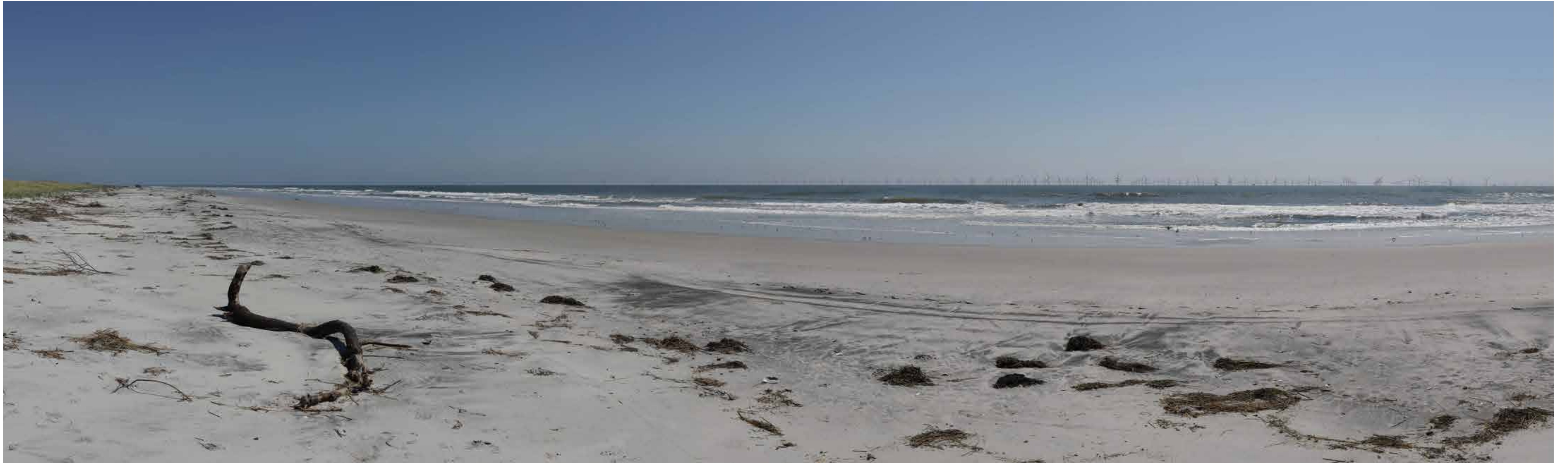
Daytime east view of full lease build-out at North Brigantine Natural Area, Brigantine City, New Jersey

Key Observation Point BC02 - Distance to Project 9 miles