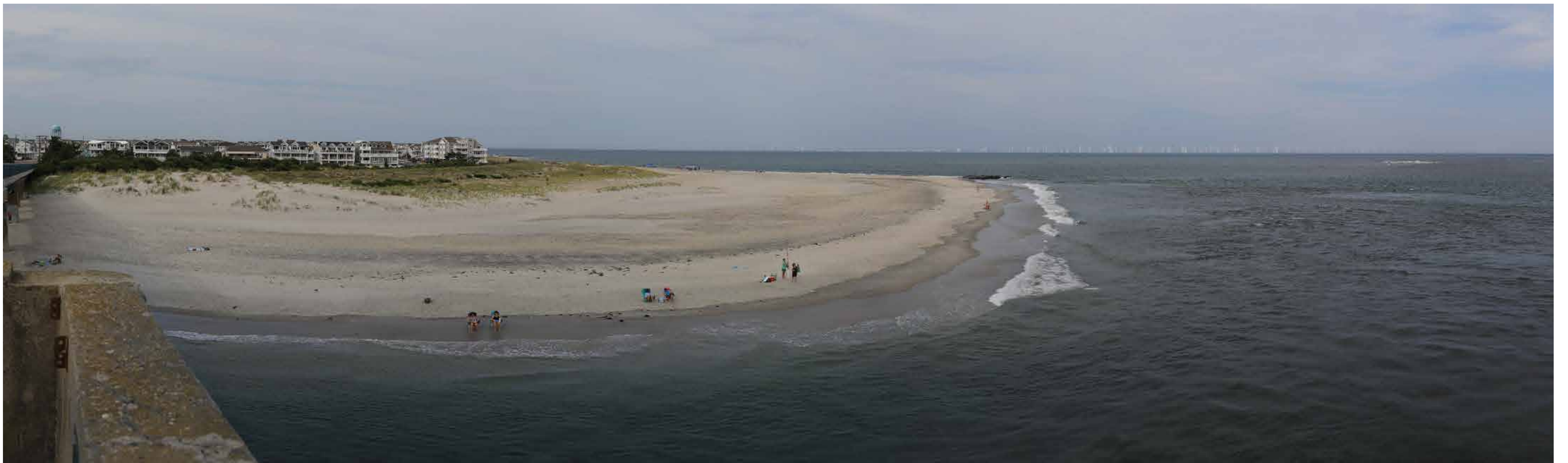
Daytime east-northeast view of full lease build-out at Townsend's Inlet Bridge, Sea Isle City, New Jersey

Key Observation Point SIC02 - Distance to Project 27 miles