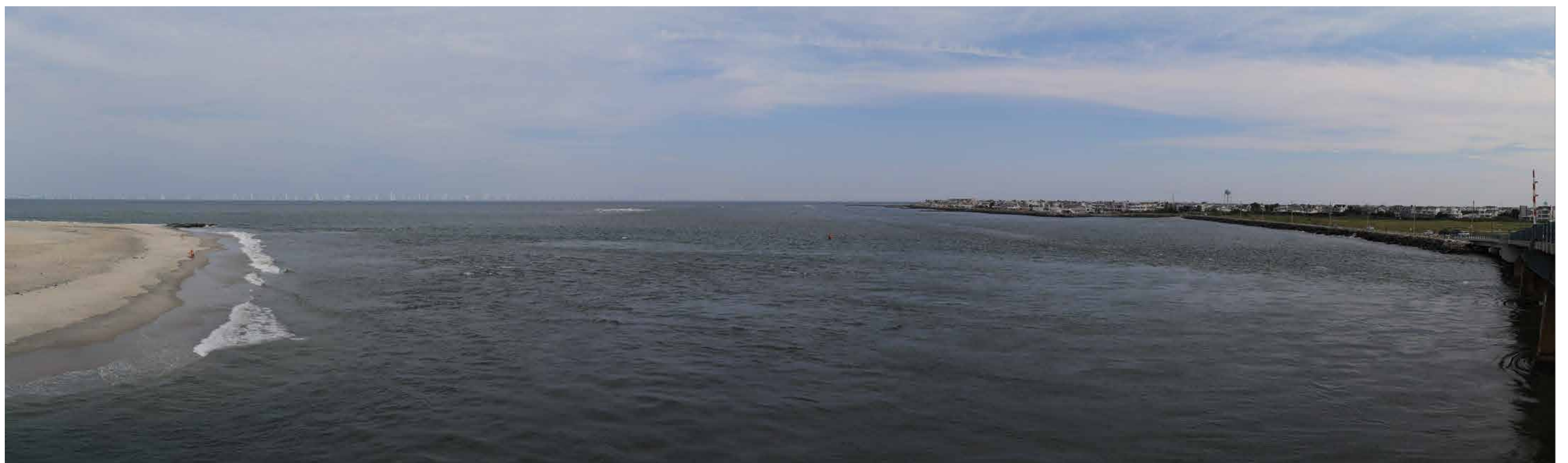
Daytime southeast view of full lease build-out at Townsend's Inlet Bridge, Sea Isle City, New Jersey