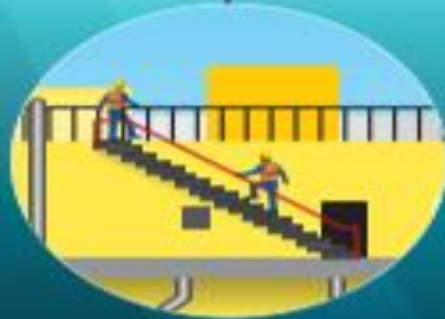
Electric Service Platform