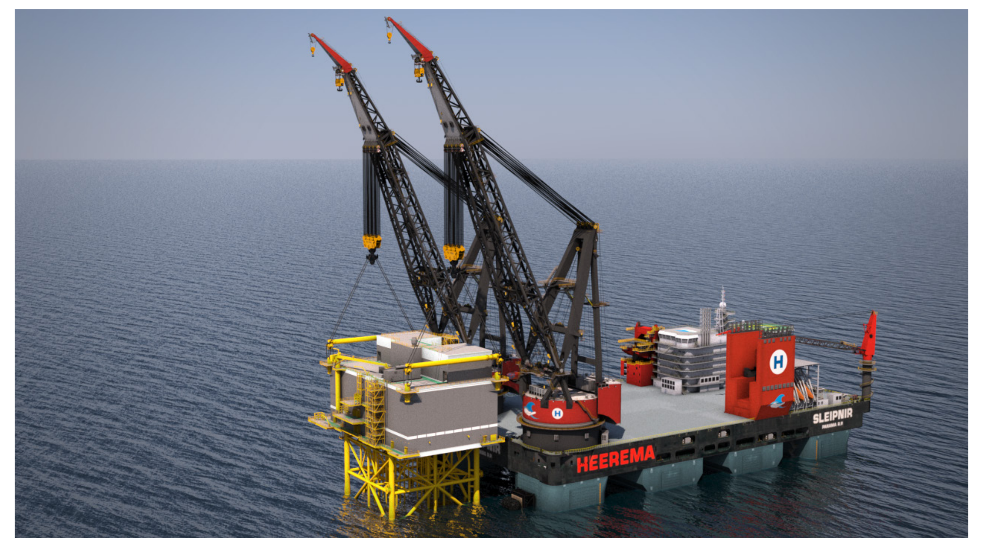
Heavy-Lift Vessel Installing an Offshore Substation Topsides