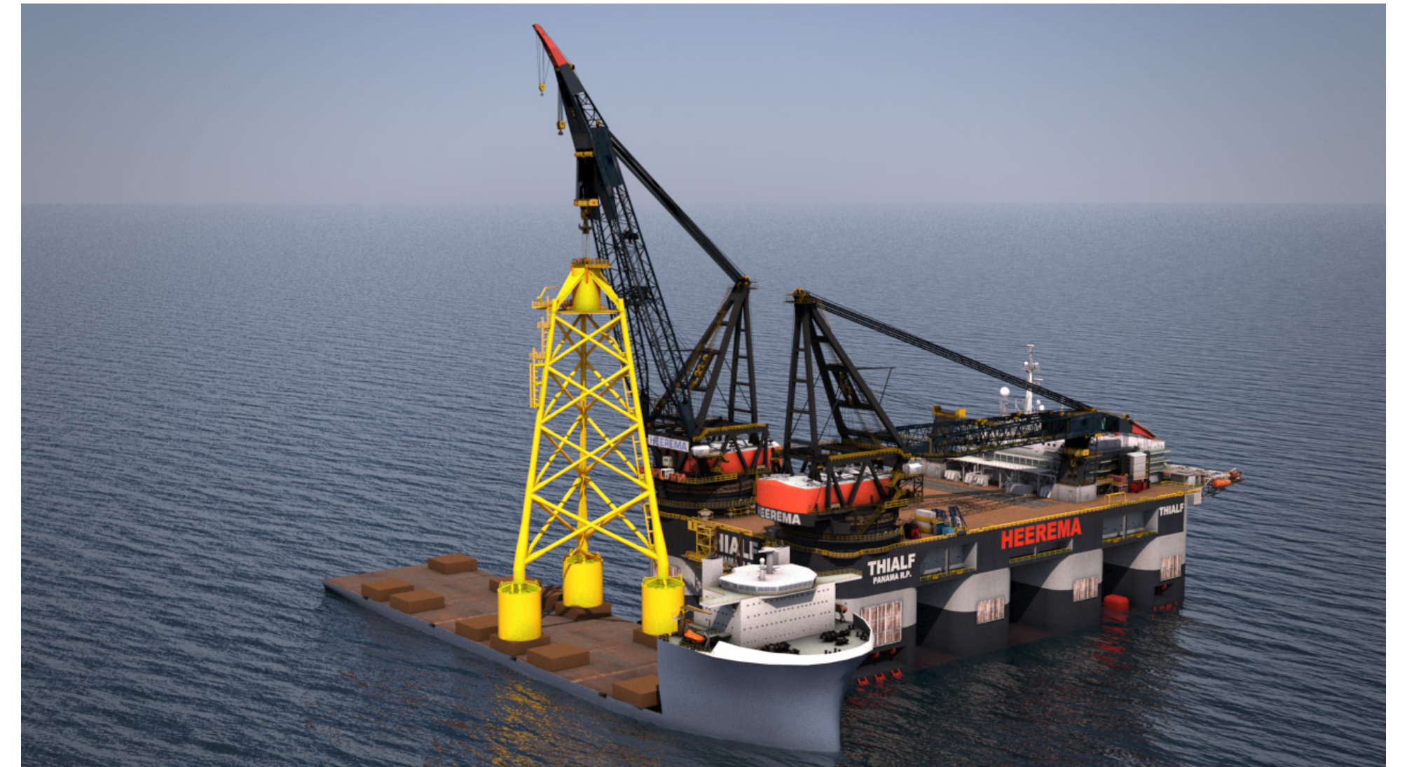
Heavy-Lift Vessel Installing a Suction-Bucket Jacket Wind Turbine Generator Foundation