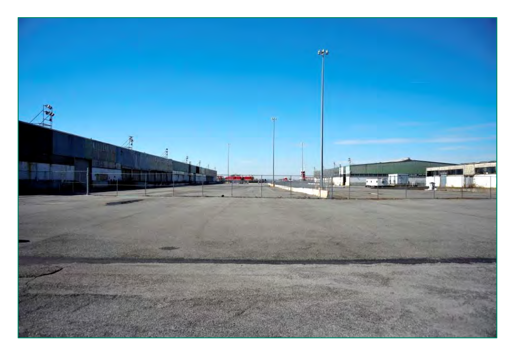
Looking west toward buildings at SBMT that will be removed (39th Street "Pier").