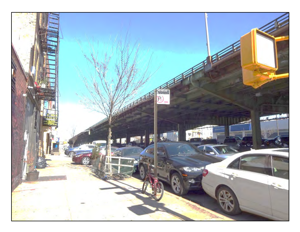
Looking toward National Register-eligible Gowanus Expressway viaduct from Third Avenue. Views are intermittently blocked by intervening development.