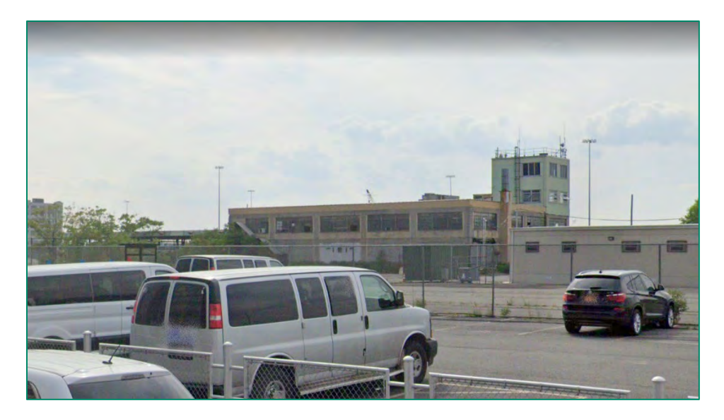
Looking west toward Tower Building at SBMT; building will be removed. Pavement will be removed and new paving and structures installed.