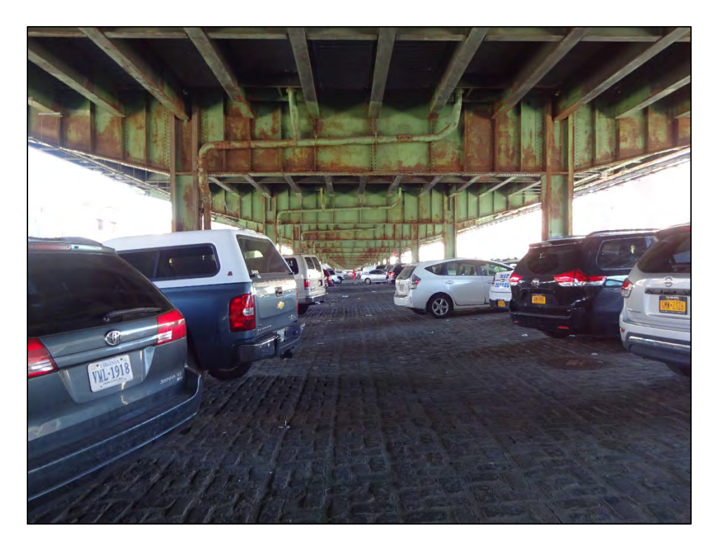
View beneath Gowanus Expressway above Third Avenue.