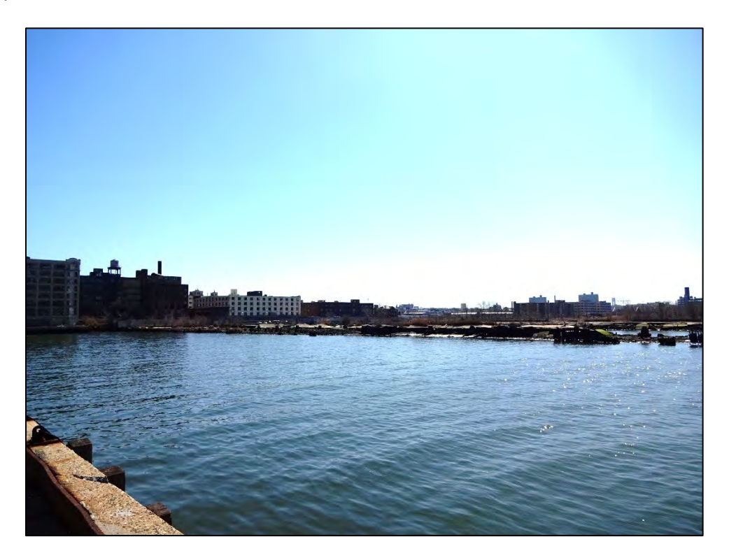
Looking south from 39<sup>th</sup> Street "Pier" at SBMT toward remnants of Pier 7 and Bush Terminal Historic District Buildings along waterfront.

Looking west toward Pier 7 in National Register-eligible Bush Terminal Historic District from SBMT 39<sup>th</sup> Street "Pier." Dredging would occur in the "interpier" basin between remnants of Pier 7 and 39th Street "Pier." Improvements would be made to the 39<sup>th</sup> Street "Pier."