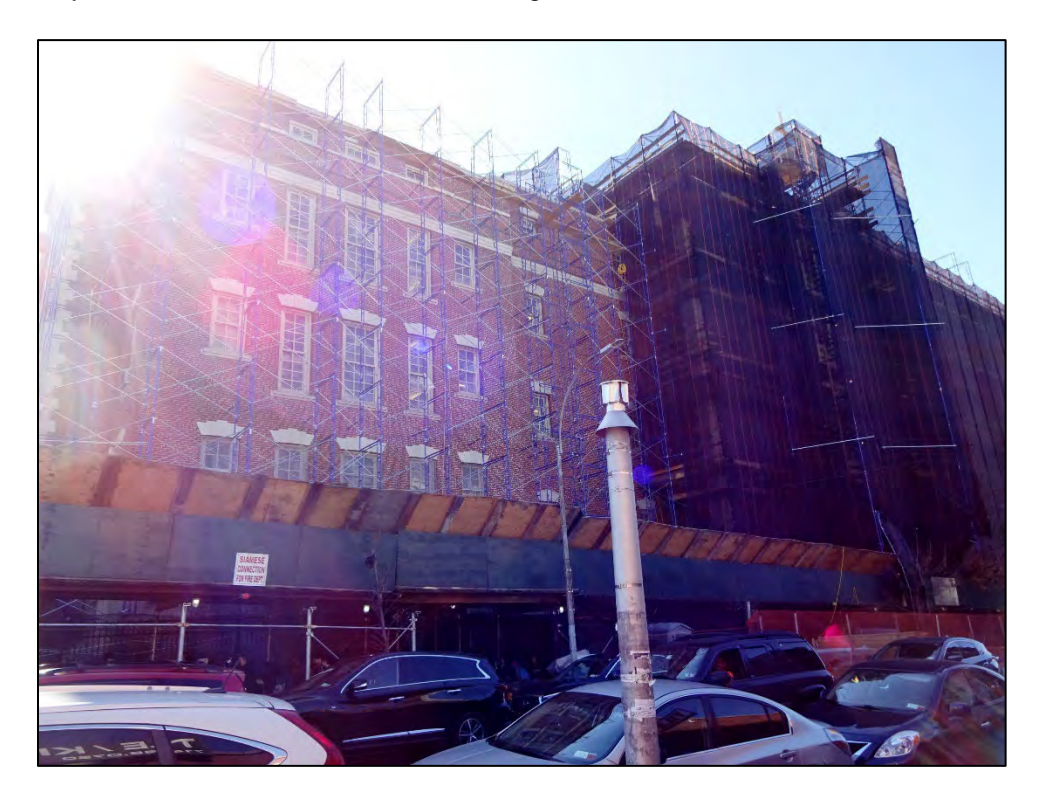
Looking south toward I.S. 136 from north side of 40<sup>th</sup> Street.

National Register-eligible I.S. 136 at the corner of Fourth Avenue and 41st Street. Building is approximately 1,600 ft removed from SBMT. Looking northward from the south sidewalk of 41st Street