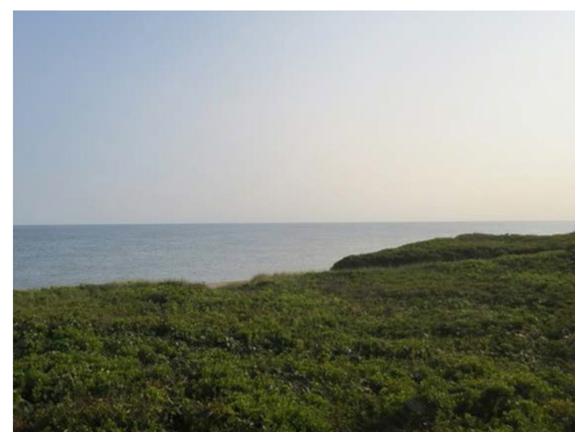
Tom Nevers Field, Nantucket