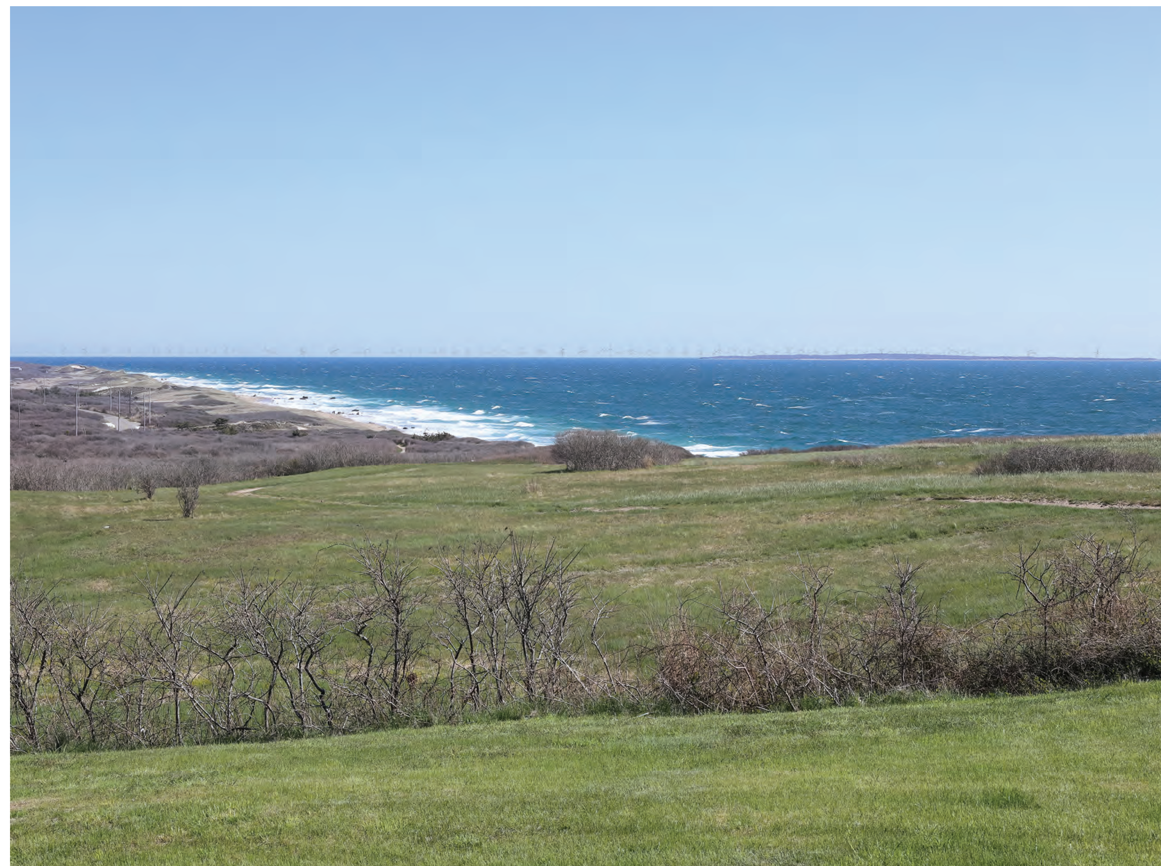
Aquinnah Cultural Center, Photographic Simulation (zoomed in)