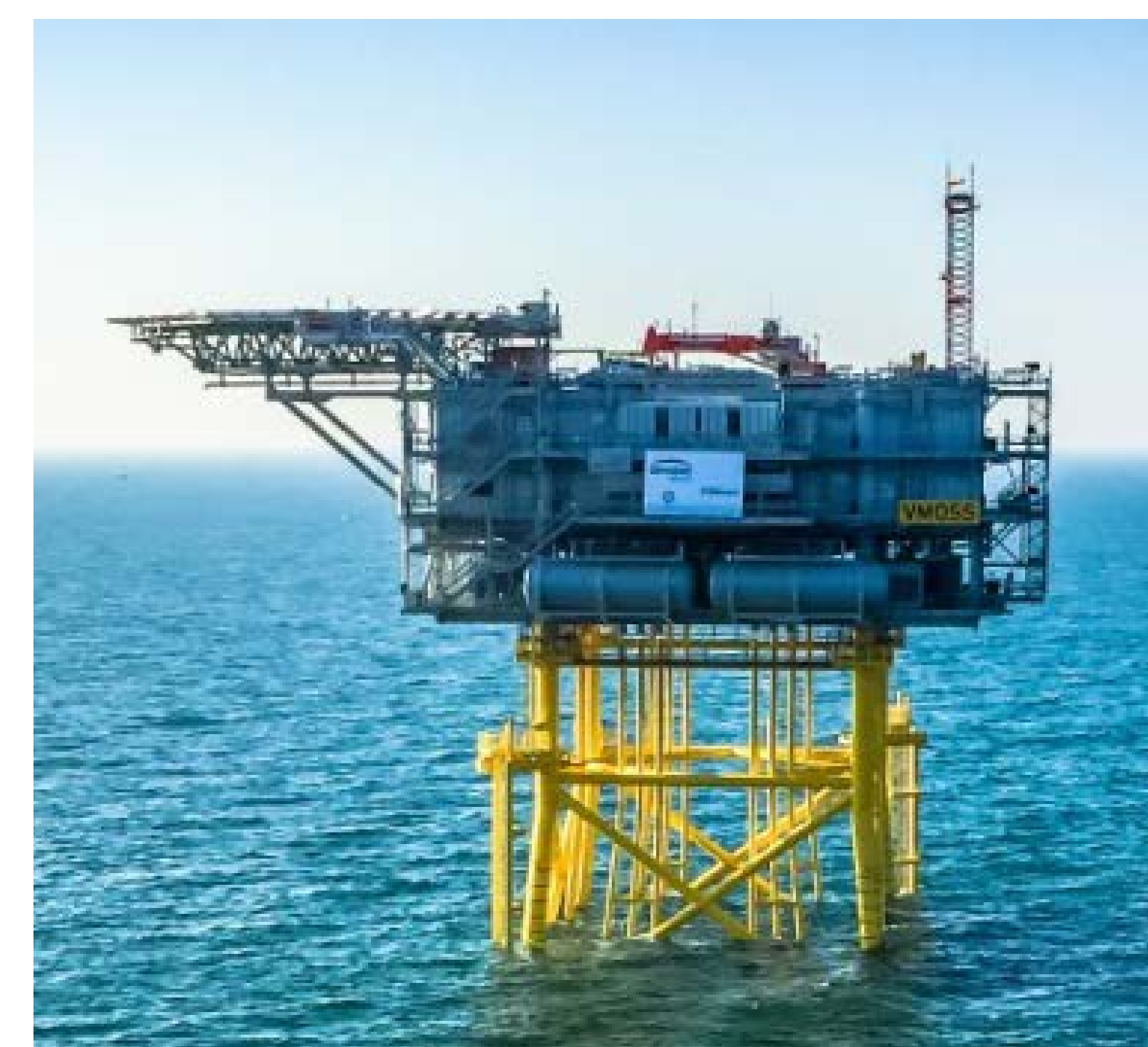
Indicative image: Electrical Service Platform with a jacket foundation