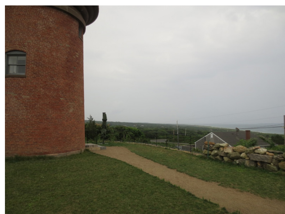
Gay Head Lighthouse, Aquinnah