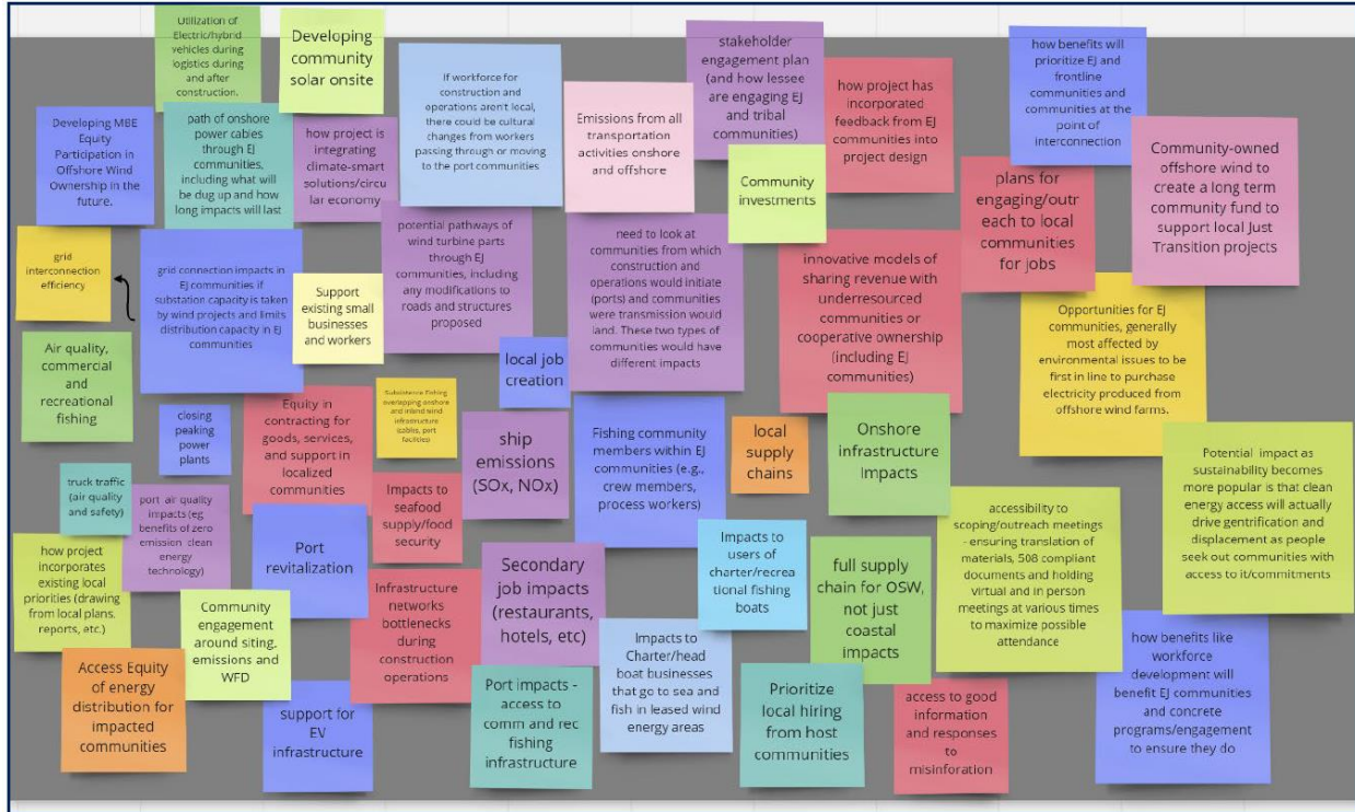
Figure 2: Miro Board Ideas Shared at July 21, 2022 EJ Roundtable