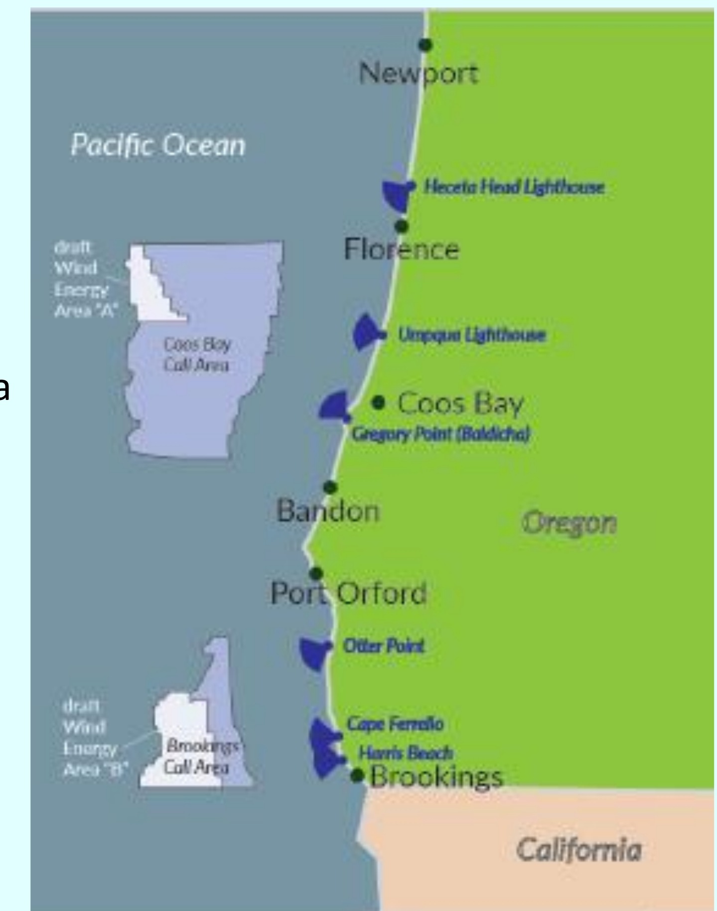
Map of Oregon Coastline with BOEM-Oregon Call Areas, Draft Wind Energy Areas