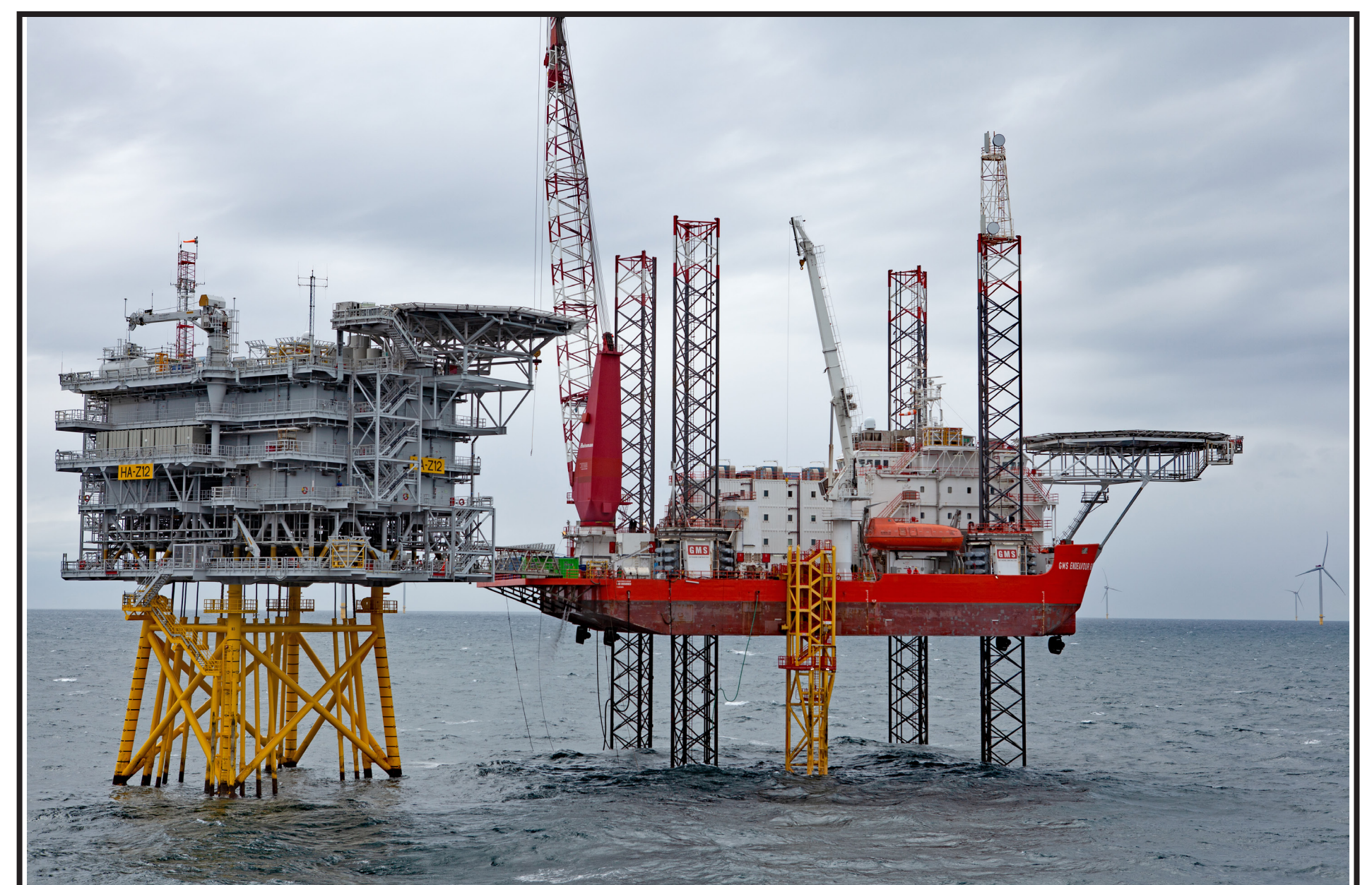
Installation of Offshore Substation