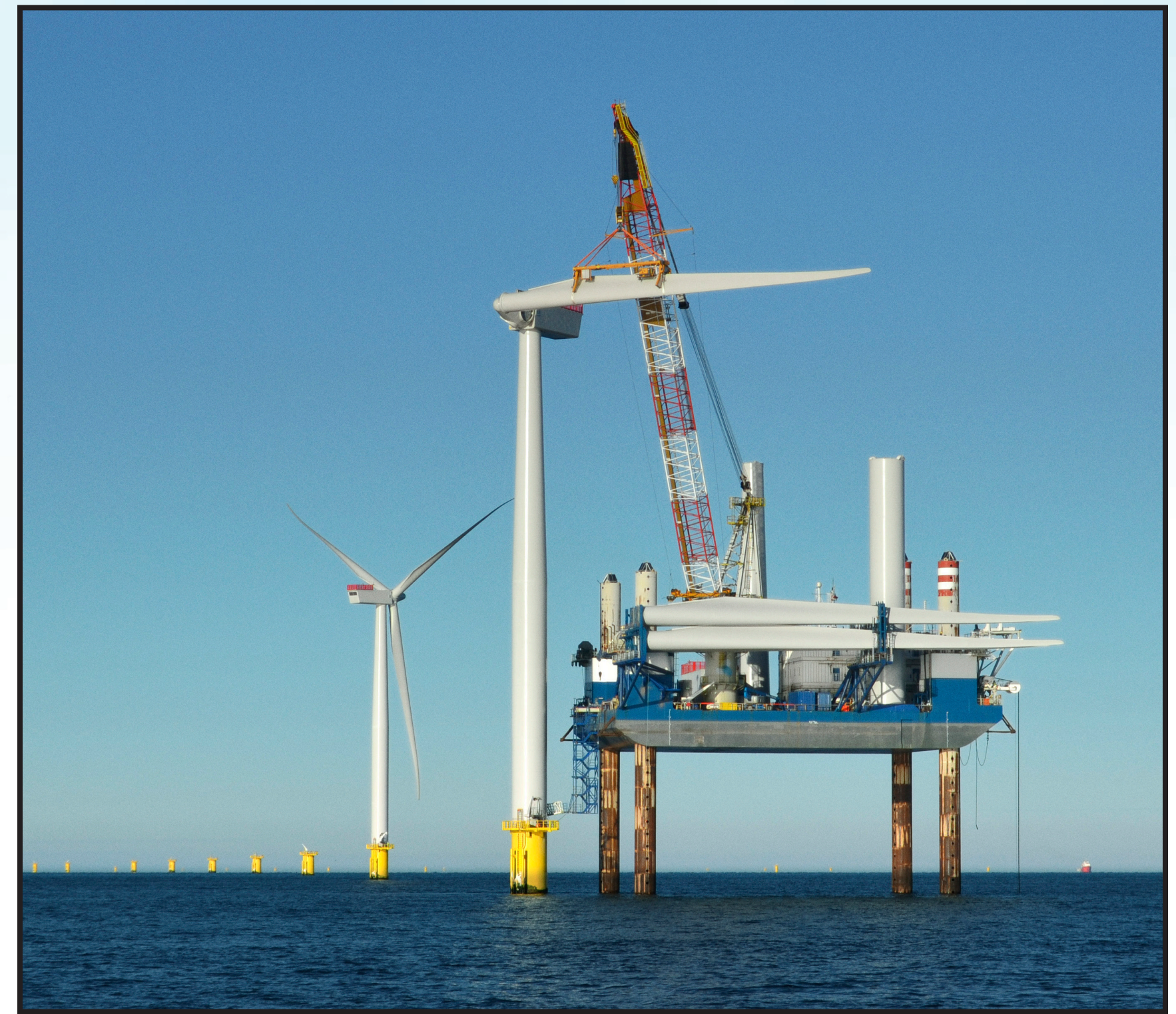
Wind Turbine Installation