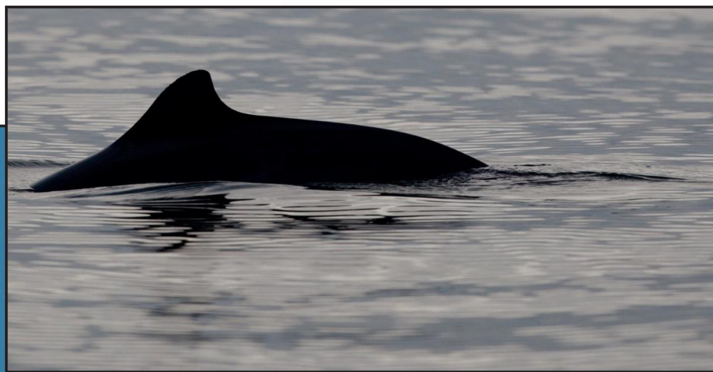
Studies in European waters show that harbor porpoises may leave an area and feed less when pile driving begins, but generally return within weeks after pile driving activities end.