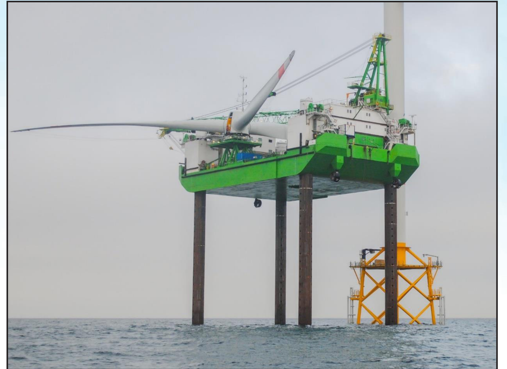
A jack-up vessel installs an offshore wind turbine. The tower is on a jacket foundation secured to the seafloor by pile driving.