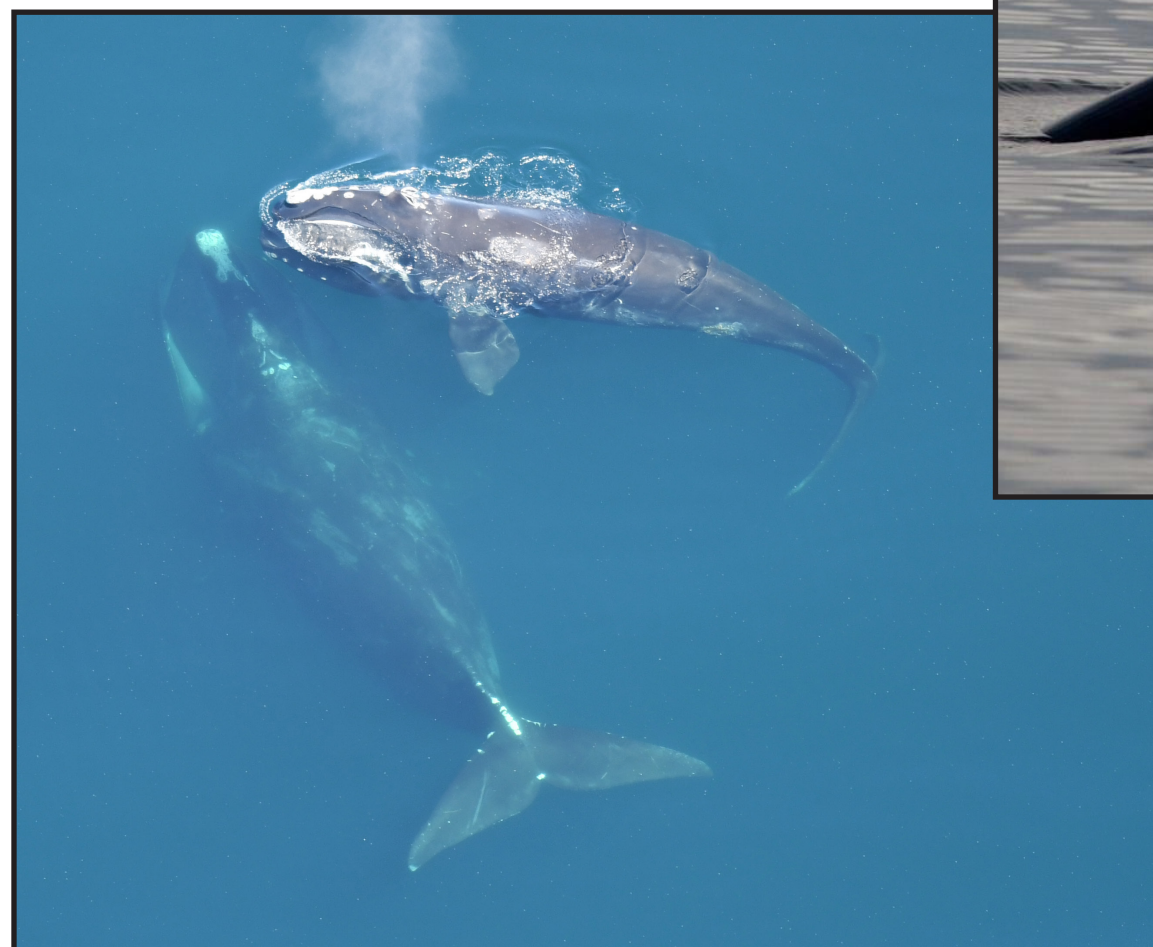
The population of North Atlantic right whales is highly endangered and is a species of particular interest in Massachusetts and Rhode Island. Photo taken under NMFS permit number 19674.