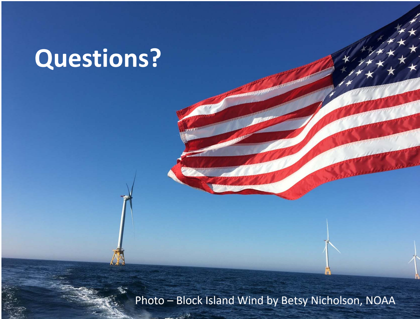
Photo – Block Island Wind