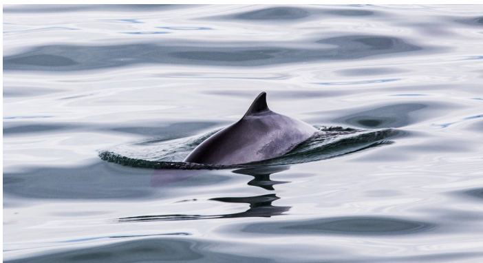
Studies in European waters show that harbor porpoises may leave an area and feed less when pile driving begins but generally return within weeks after pile driving activities end.

There are many different sounds related to offshore construction activity, including the intentional transmission of sounds for characterizing the environment such as geophysical sonars, and the inadvertent transmission of sounds such as from vessel engines and pile-driving activity. Some sounds will only be present during certain stages over the life of an offshore wind facility.