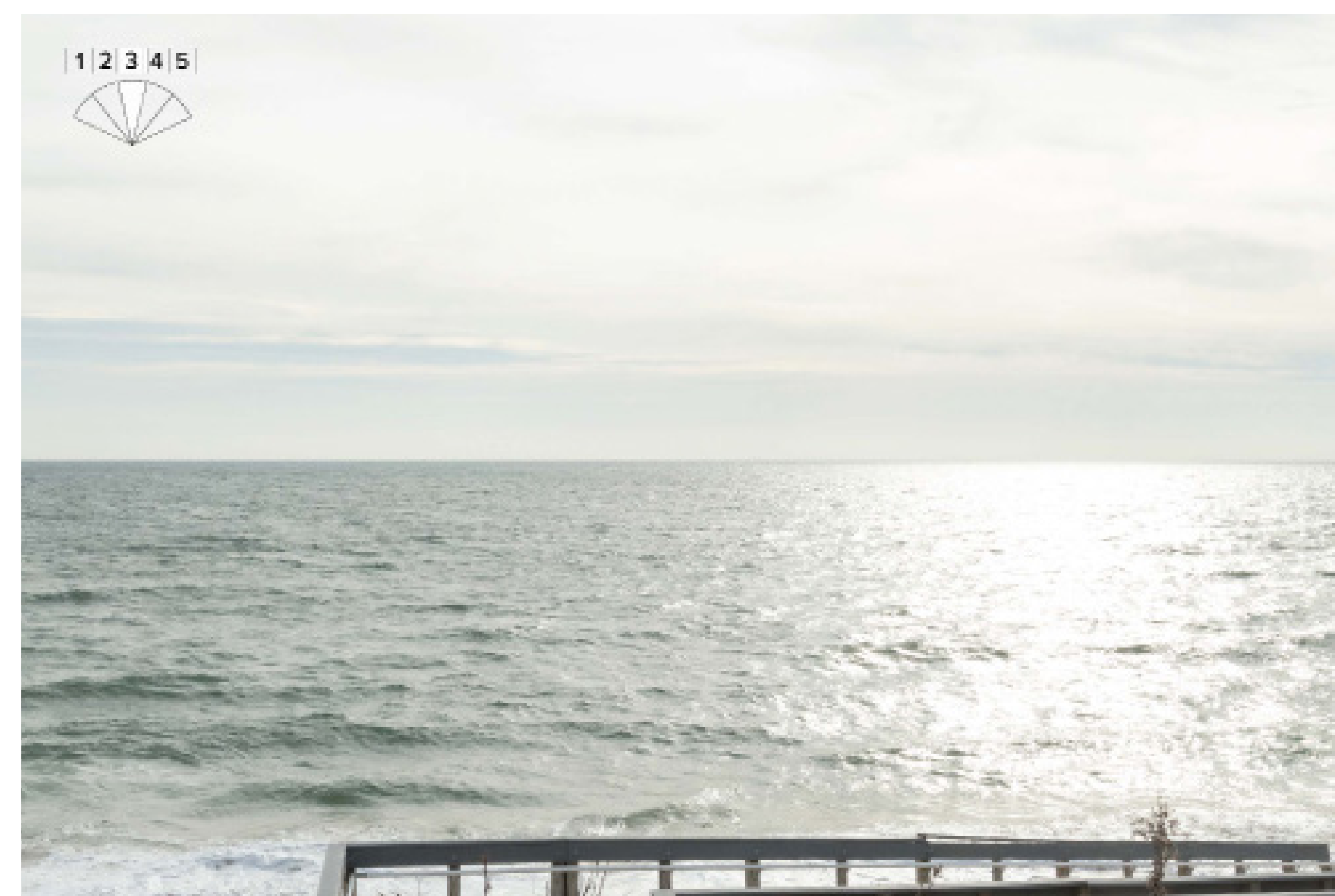
Cropped 50 mm Focal Length equivalent simulation illustrating the size and scale the WTGs would appear from the KOP, but does not show the visual horizon occupied by WTGs.