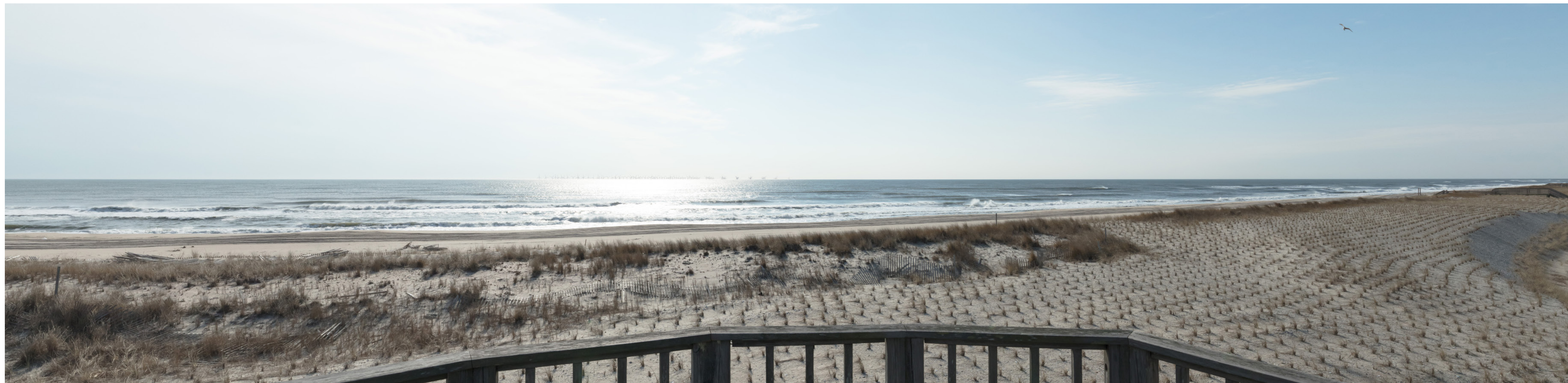
124° Horizontal Human Field-of-View simulation showing the visual horizon potentially occupied by wind turbine generators (WTG). The WTGs appear smaller than what would be seen when at the KOP.