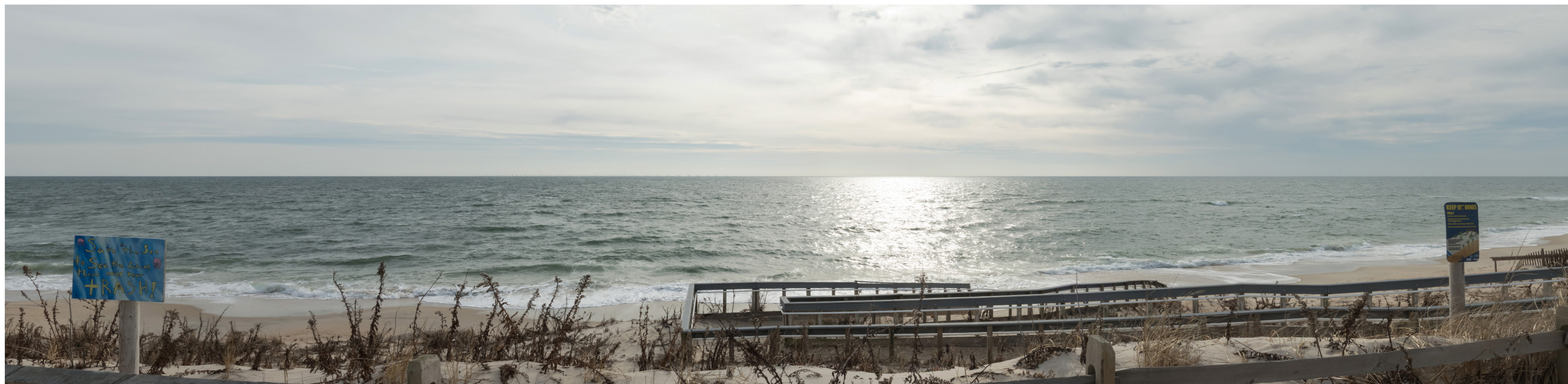
124° Horizontal Human Field-of-View simulation showing the visual horizon potentially occupied by WTGs. The WTGs appear smaller than what would be seen when at the KOP.