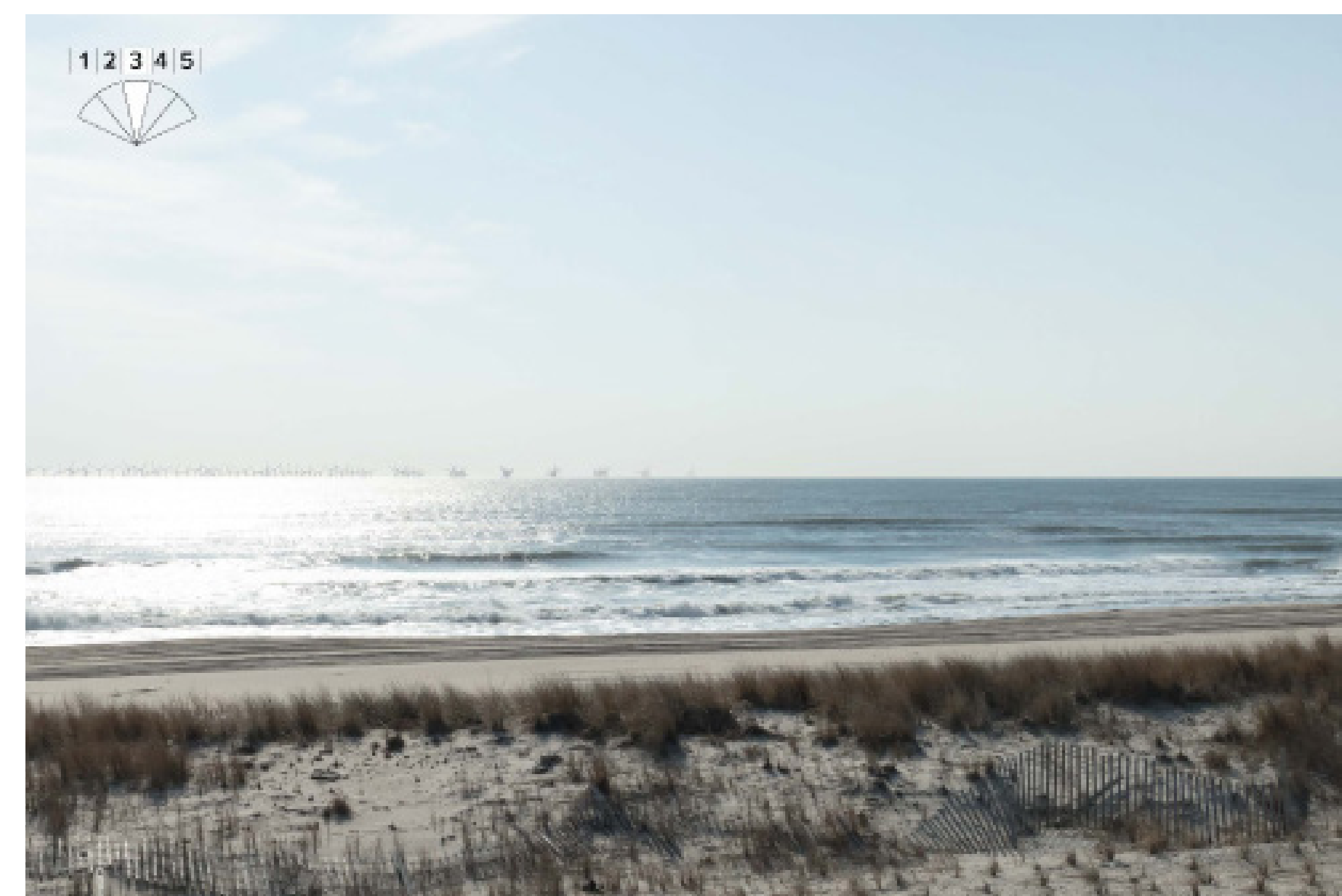
Cropped 50 mm Focal Length equivalent simulation illustrating the size and scale the WTGs would appear from the KOP, but does not show the visual horizon occupied by WTGs.