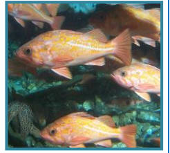
Vermilion rockfish