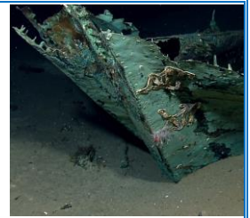
19 th century shipwreck, Gulf of Mexico.