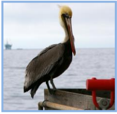
Pacific pelican